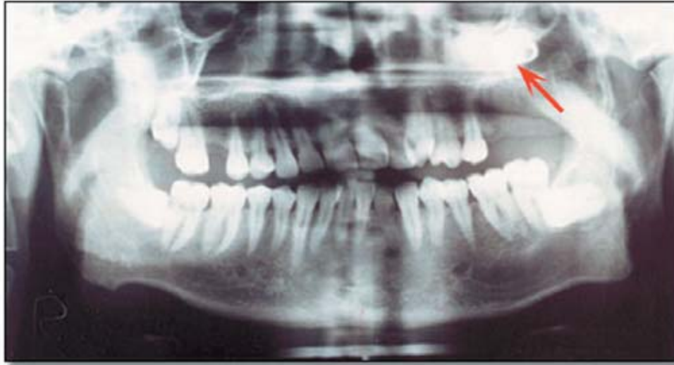
Figure 1. The panoramic radiograph revealed a radiopacity in the left maxillary sinus.