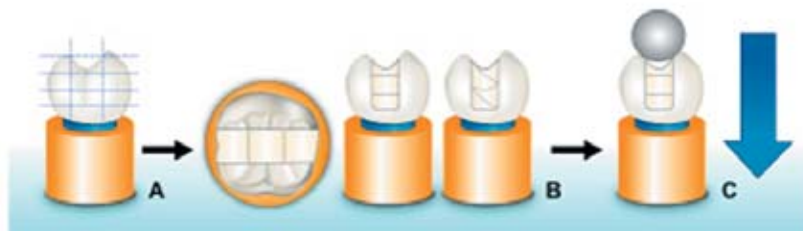
Figure 1. A. Cavity preparation, 1/3 the distance between the cusp tips and 3/4 the height of the crown; B. Vertical, horizontal, and oblique filling layers; C. Fracture test.

The specimens were stored for 24 hours in 100% relative humidity at 37°C, and the fracture test was conducted in an Instron testing machine (Instron Corp, Canton, England 02021 – 1089) with 500 Kg load. A 4 mm diameter steel sphere contacted the buccal and lingual cusps of the tested teeth at a crosshead speed of 0.5 mm/min until fracture occurred (Figure 1C).