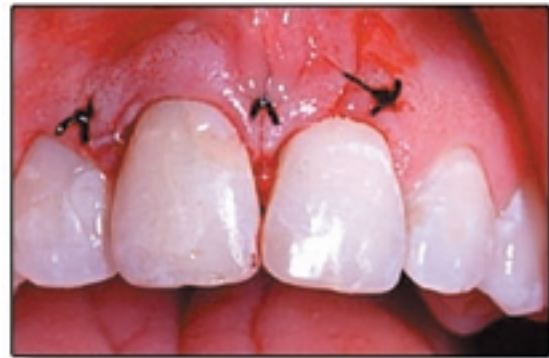
Flap sutured with 4.0 black silk sutures.

After copious sterile saline irrigation of the surgical site, the flap was replaced and sutured with 4-0 black silk (Figure 6).