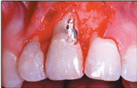
Excessive gutta-percha removed from area of root perforation.

Surgical exposure and soft tissue debridement of the area revealed an extensive lesion involving the mesial-facial aspect of the root. A #6 round carbide bur was used to remove excessive gutta-percha from the perforated area as well as to expose a margin of root surface (Figure 4).