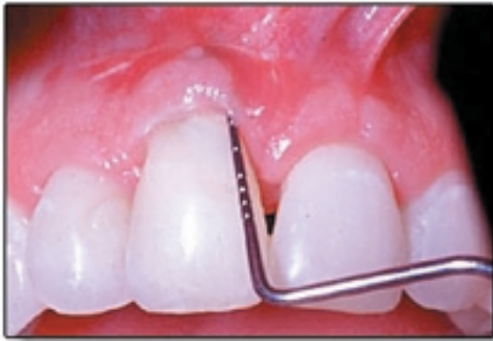
Seven-month post surgical follow-up reveals good tissue healing with less than 3 mm probing depth and excellent tissue response to the resin-ionomer.