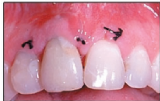
One-week surgical follow-up. Good tissue tone and color, however, a slight dehiscence has developed on the mid-facial of tooth #9.

Healing was uneventful. Other than soreness in the area, the patient voiced no complaints. Sutures were removed one week after surgery. Tissues were judged to be of good tone and color, although a slight gingival dehiscence was noted on the facial of the left central incisor. This dehiscence could have probably been avoided by including the distal papilla of the left central incisor in the initial flap elevation (Figure 7).