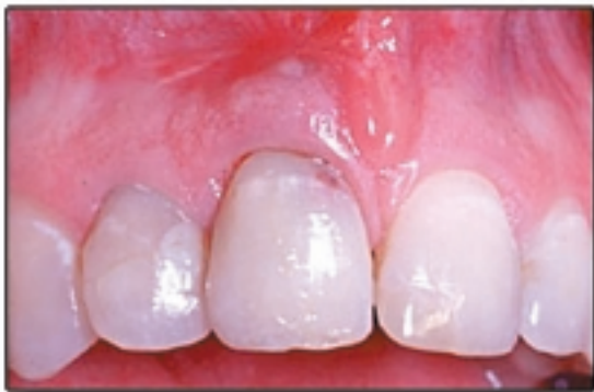
Pre-surgical presentation of maxillary right central incisor (tooth #8)

A healthy 32-year old man was referred to the periodontic department for treatment of deep periodontal probing depths and radiographic bone loss associated with the maxillary right central incisor (tooth # 8) (Figure1).