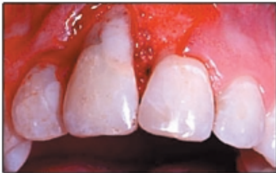
Resin-ionomer placed and contoured with a finishing bur

Since glass ionomer resins will bond to root structure, no definitive mechanical preparation of the tooth is mandatory, although slight mechanical retentive grooves were utilized in this case. Following acid etching and bonding of the root surface, the restorative material was placed, light cured, and allowed to chemically cure for 10 minutes. The resin-ionomer was then contoured with a flame shaped finishing bur (Figure 5).