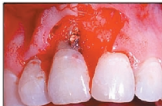
Perforation exposed following flap reflection and debridement. Note: Flap reflection should have included the distal papilla of tooth #9.

Following a 60 second presurgical chlorhexidine rinse and administration of local anesthesia, a full thickness flap was reflected to expose the lesion (Figure 3).