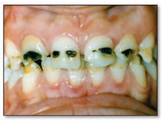
Figure 1. Case 1. Preoperative appearance of the anterior teeth.

The prepared teeth were then etched with 35 percent orthophosphoric acid: 15 seconds for dentin and 30 seconds for enamel (Vococid; Voco, Cuxhaven, Germany). The teeth were rinsed with water to remove the etching agent. One-bottle bonding agent was applied (Single Bond, 3M-ESPE, St. Paul, MN, USA) following the manufacturer's instructions. Then resinbased composite (Valux Plus; 3M-ESPE, St. Paul, MN, USA) was used in the restoration