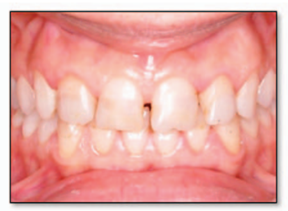
Figure 4. Case 1. Five years after treatment completion. Esthetic appearance has been improved and the composite laminate veneers are still satisfactory, although not ideal in appearance. Resin chipping led to the reappearance of the entire midline diastema.

of the patient's maxillary anterior teeth. The composite resin was visible light polymerized for 40 seconds and any residual excess at the restorative margin was removed with a series of finishing burs, followed by polishing to a high luster using aluminum oxide discs (Sof-Lex; 3M ESPE, St. Paul, MN, USA) (Figure 2). The patient was recalled approximately every six months for follow-up examinations. At the one-year followup appointment, no chipping, discoloration, or secondary caries were noted (Figure 3). During the follow-up examination pulp vitality testing was conducted using a vitalometer (Parkell Electronics Division, Farmingdale, NY, USA). The periodontal status of the restored teeth was evaluated using a gingival index (GI) by pocket probing (Hu-Friedy, Chicago, IL, USA). At the five-year follow-up visit, neither secondary caries nor marginal discoloration were detected. However, the diastema between the central incisors was evident again, apparently due to chipping of the composite resin, but it was not as wide as its original dimension (Figure 4). Despite the return of the midline diastema, the patient was quite satisfied with the composite laminate veneers both esthetically and functionally.