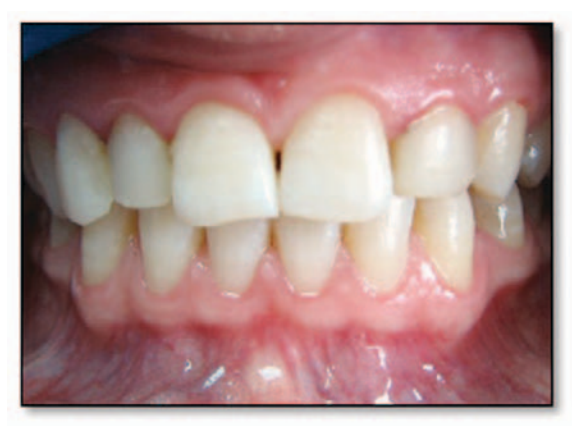
Figure 7. Case 2. One year after completion of the treatment.

Paul, MN, USA). Any necessary occlusal equilibration was accomplished with an egg-shaped bur and the final polishing was repeated. At the completion of placement (Figure 6), the importance of rigorous and effective oral hygiene was reemphasized, and the patient was recalled at six-month intervals. One-year follow-up results showed this treatment was a viable technique in esthetic enhancement of the anterior region (Figure 7).