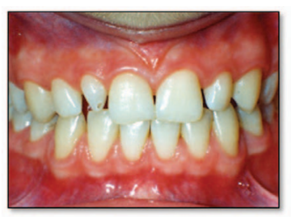
Figure 5. Appearance of teeth before treatment in Case 2.

A 15-year-old female patient was referred to the Department of Restorative Dentistry at Ataturk University for evaluation and possible treatment of her maxillary anterior teeth. Prior to treatment, detailed dental, medical, and social histories were obtained from the patient.