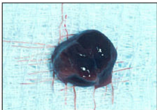
Figure 2. Excised clot.