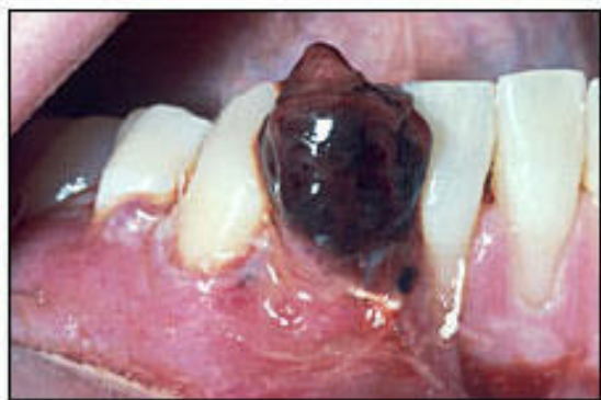
Figure 1. Patient presents 24 hours post-periodontal surgery with fibrin-like "Liver clot".

with the surgical site in the area of the right lateral incisor. (Figure 1) The mass was removed with a curette in one piece. (Figure 2) No hemorrhage was apparent, and the patient had no further post-surgical complications. The mass was clinically determined to be a "liver clot" or "currant jelly clot."