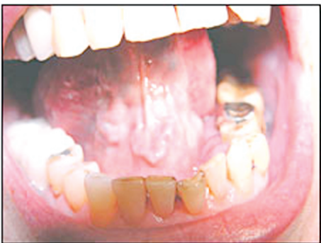
Figure 5. One week after initial surgery - hematoma is almost completely dissipated.