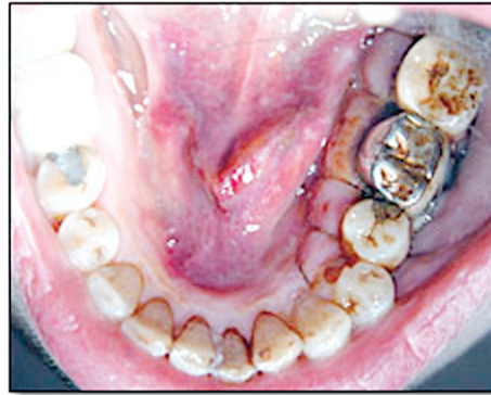
Figure 4. Hematoma crossing the midline and causing elevation of the floor of the mouth.