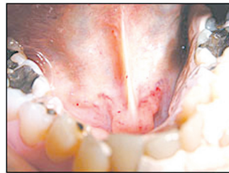
Figure 2. Seven days after periodontal surgery. Note the dramatic improvement.

alveolar nerve block followed by local infiltration around the surgical site with one carpule of 2% lidocaine with 1:50,000 epinephrine. Sulcular incisions on the buccal and lingual surfaces facilitated the release of full thickness mucoperiosteal flaps. After marginal bone recontouring, a residual two-wall infrabony defect was observed around teeth #17 and #18. In addition, a Class II buccal furcation lesion was probed on #18. Bone grafting material was harvested from the mandibular lingual torus and other exostoses in the premolar and molar areas and combined with a bovine Bio-Oss® xenograft (Geistlich Pharma AG, Wolhusen, Switzerland) for placement within the defects. A porcine collagen membrane was used to cover the grafted site, and the flaps were re-approximated with five 4-0 PLA-PGA Vicryl sutures (Ethicon, mantzikosville, NJ, USA) to achieve primary closure. The collagen barrier extended approximately three millimeters beyond the grafted sites and was fully submerged below the flaps. A Coe Pak® surgical dressing was placed on the lingual surface only.