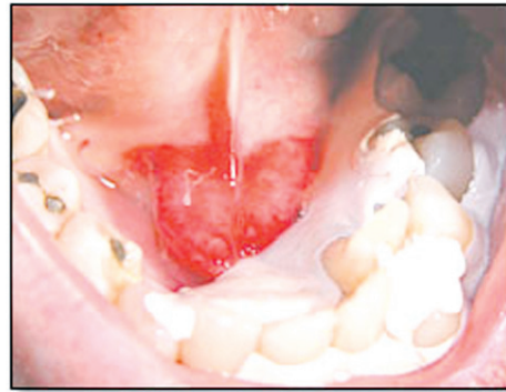
Figure 1. View of the hematoma on the morning after periodontal surgery on the mandibular left quadrant. Note the edema and erythema of the floor of the mouth.

One carpule of 2% lidocaine with 1:100,000 epinephrine was administered for an inferior