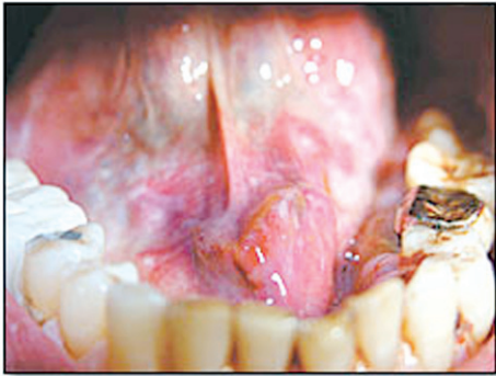
Figure 3. Morning after periodontal surgery on the mandibular left quadrant. The patient was still experiencing bleeding from the lingual free gingival margin.