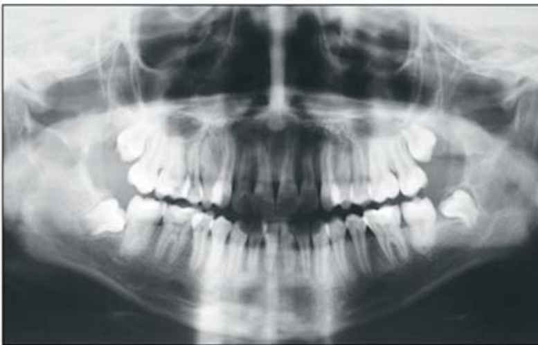
Figure 4. Radiographic follow-up at seven years.