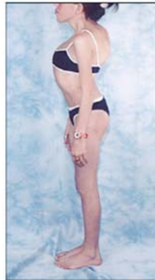
Figure 1. Physical and skeletal characteristics of a 14-year-old girl with a giant cell, Noonan-like phenotype.

The first case of NS described by Noonan and Ehmke (1963) 8 did not include lesions of giant cells in its list of characteristics. Later reports on the syndrome associated giant cell lesions with the condition. If the lesions occurred in the mandible, they were called NS associated and were associated with cherubism or with the