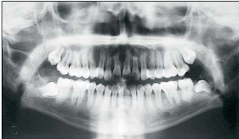
Figure 3. Radiographic follow-up at six years showing a slow regression of the lesions.