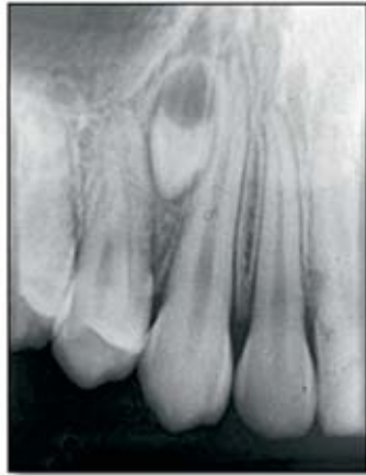
Figure 3. Periapical radiograph showing the presence of a supernumerary tooth located between the roots of the maxillary right first premolar and the canine.