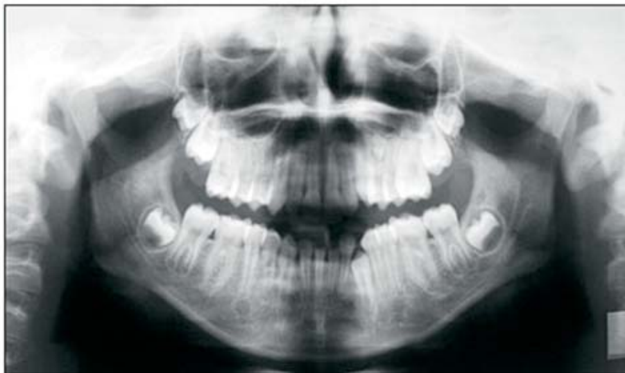
Figure 1. First panoramic radiograph of the patient at age 11 years showing the presence of three supernumerary teeth in both maxillary premolar regions and mandibular right premolar region.

It is rare to find multiple supernumerary teeth with no associated diseases or syndromes. The few studies have found the prevalence of supernumerary teeth in permanent dentition to range from 0.15% to 3.8%. 6 Scheiner 7 reported an occurrence of 11.1% for multiple supernumerary teeth, while Asaumi 8 found the prevalence for