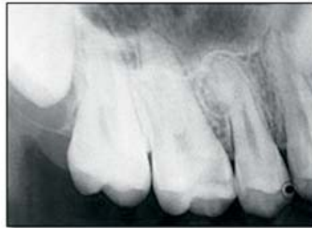
Figure 4. Periapical radiograph showing the presence of a supernumerary premolar tooth and a supernumerary molar tooth in right maxilla.