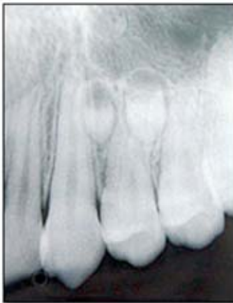
Figure 5. Periapical radiograph showing the presence of supernumerary teeth in the left maxilla.