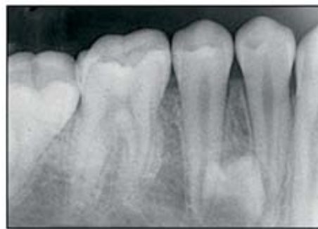
Figure 6. Periapical radiograph showing the presence of a supernumerary premolar tooth which was located between the roots of the mandibular right premolar teeth.