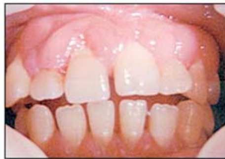
Figure 4. Anterior view at the recall one month examination.

One Week: Brushing method was evaluated during this visit. The patient was following the given instructions. The patient was appointed for a recall examination in one month.