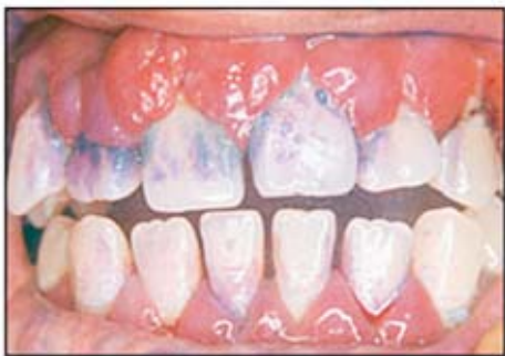
Figure 1. Anterior view following application of plaque disclosing dye.

Intraoral periapical radiographs showed a combination of horizontal and vertical bone loss (Figure 3).