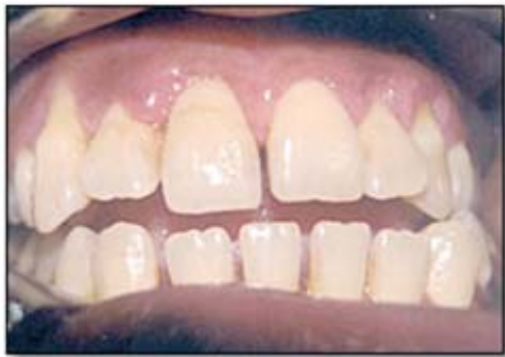
Figure 5. Anterior view at the three month examination.

previous visit. The interdental papillae were mildly inflamed. The mobility in the upper right canine had reduced to Grade 1, and the upper right lateral incisor had become firm. The patient revealed she no longer experienced discomfort when brushing and gingival bleeding had completely stopped. The patient was advised to continue the maintenance regimen and to report for another examination in two months (Figure 5).