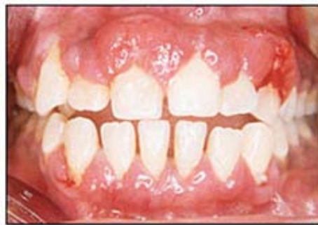
Figure 2. Anterior view at the second examination.