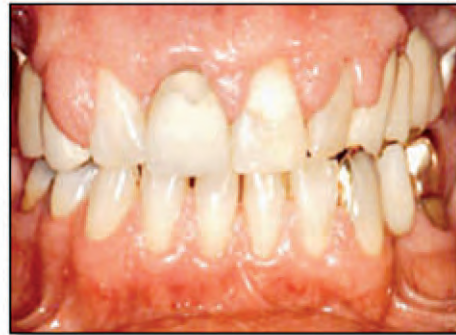
Figure 1. Clinical presentation of gingival hyperplasia.

Given the history and histological findings, the gingival lesion was diagnosed as phenobarbital-induced gingival hyperplasia.