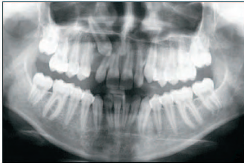
Figure 5. Panoramic radiograph of Case #1 at the end of the two-year follow-up examination.