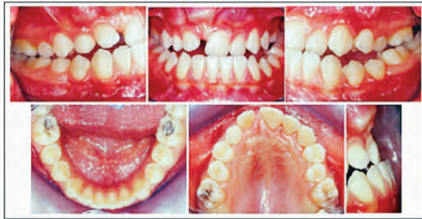
Figure 10. Pre-treatment intraoral photographs of Case #2.