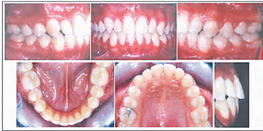
Figure 7. Post-treatment intraoral photographs of Case #1.