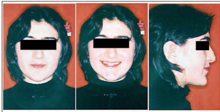
Figure 12. Post-treatment facial photographs of Case #2.

Impaction is defined as the total or partial lack of eruption of a tooth well after the normal age for eruption. An impacted tooth may appear blocked by another tooth, bone, or soft tissue, but the cause of tooth impaction is often unknown. 26