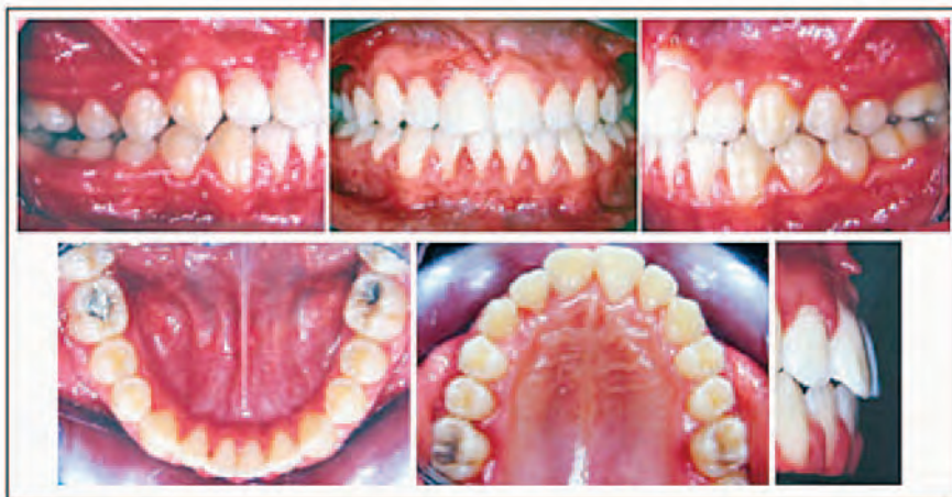
Figure 13. Post-treatment intraoral photographs of Case #2.