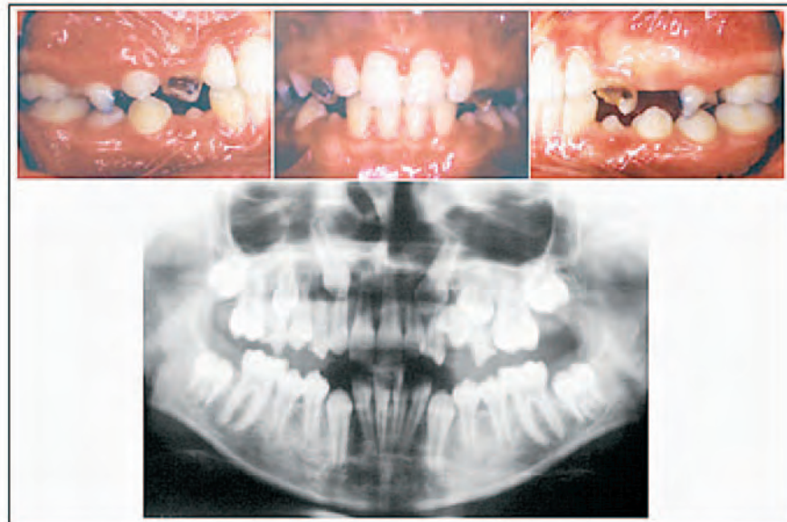
Figure 4. Intraoral photographs and panoramic radiograph of Case #1 at the end of first treatment phase.

incisor followed by fixed orthodontic treatment consisting of brackets on the incisors and bands on the molars in the upper arch. Monitoring of the eruption of the other permanent teeth would be performed periodically.