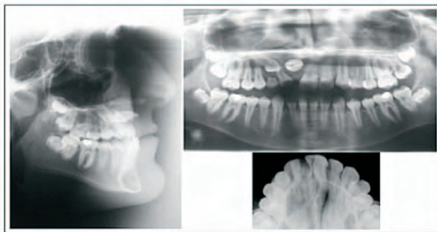
Figure 11. Pre-treatment panoramic, lateral cephalometric, and upper occlusal radiographs of Case #2.

a severe midline deviation as a result of drifting of the adjacent teeth into the edentulous space.