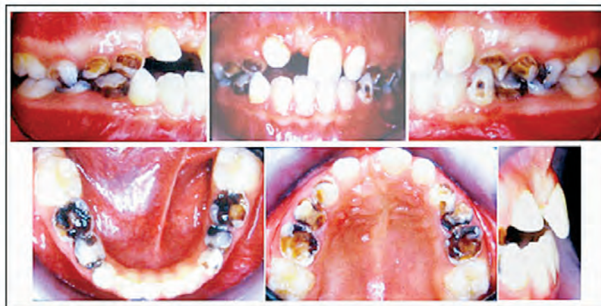
Figure 2. Pre-treatment intraoral photographs of Case #1.