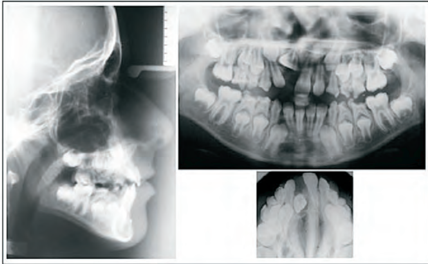
Figure 3. Pre-treatment panoramic, lateral cephalometric , and upper occlusal radiographs of Case #1.