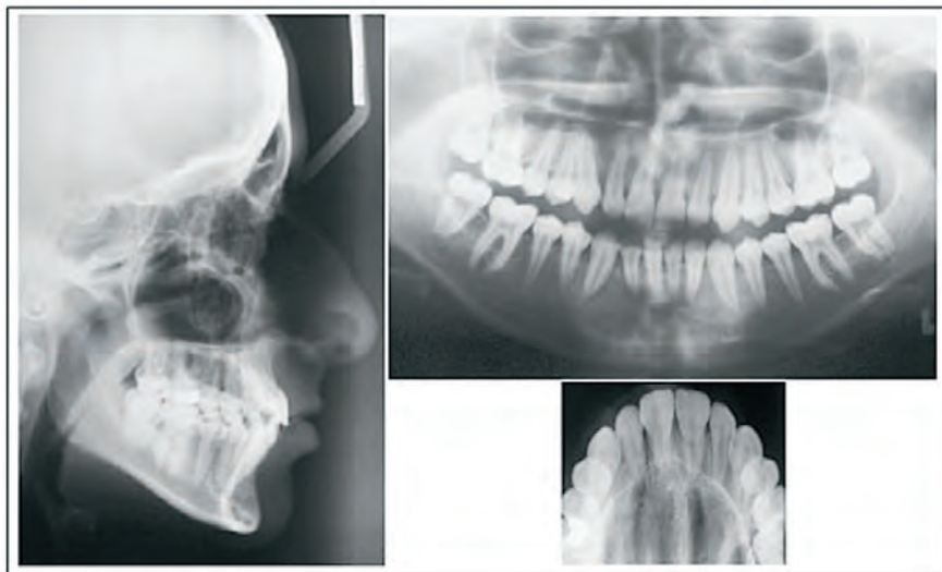
Figure 8. Post-treatment panoramic, lateral cephalometric, and upper occlusal radiographs of Case #1.