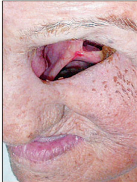
Figure 2. Oblique view of the anatomical defect showing the communication with the nasal cavity.

problems, such as difficulty with breathing, chewing, deglutition, speech as well as serious psychosocial problems.