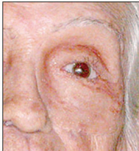
Figure 5. Facial prosthesis in place after one year of use.

results, although this surgery can be a challenge to the professional.