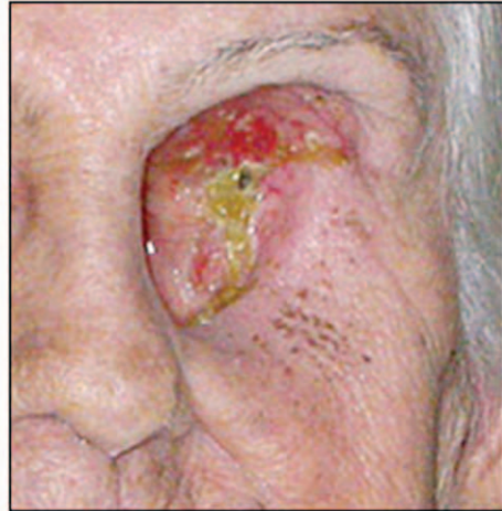
Figure 1. Anterior view of the anatomical defect following the maxillectomy.

A 78-year-old edentulous woman patient came for a post surgery prosthetic evaluation. Her medical history showed a partial maxillectomy and left orbital exenteration which removed all adjacent tissues (Figure 1). Therefore, there was open communication between the oral, nasal, and orbital cavities (Figure 2). The mutilation left the patient with esthetical and functional