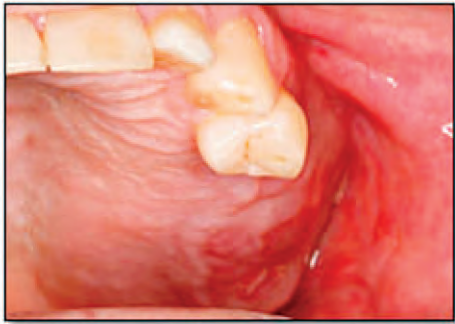
Figure 3. Initial clinical presentation of patient #2 with soft tissue swelling in the maxillary left quadrant with a history of dental extractions of the molar teeth in the region seven months earlier.