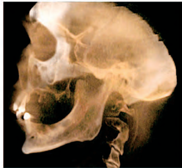
Figure 6. Three-dimensional reconstruction of cone-beam CT scans shows extensive necrosis of the left maxillary bone extending towards the sinus floor and demonstrating sequestering alveolar sockets.

tissue such as the tongue or other oral structures. In advanced cases with symptoms such as paresthesia or pain, sequestrectomies were performed as needed to control disease or prevent further progression.