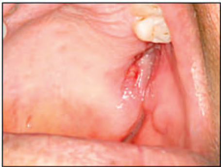
Figure 5. Spontaneous sequestration occurred a month later, and soft tissue coverage was achieved shortly thereafter with the patient on a 0.12% chlorhexidine mouthrinse and frequent warm saline rinses at home daily.