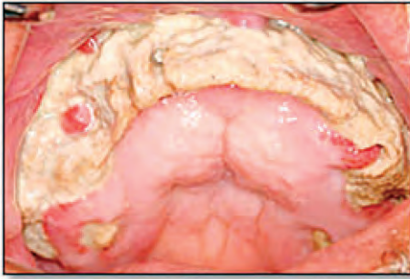
Figure 1. Extensive ONJ of the upper jaw in patient #3 showing nothing but maxillary skeleton coated with white plaque-like debris in addition to a reactive granulation tissue-like response involving the palate.