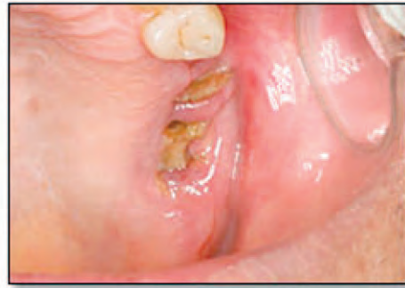
Figure 4. After one week of systemic antibiotics, the swelling dramatically subsided, exposing necrotic maxillary bone.