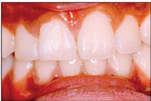
Figure 6. Completed case.

While the tooth was being positioned in the arch, its pulp vitality and periodontal health were maintained with no signs of root resorption. When the occlusion was stabilized, the orthodontic appliance was removed and the patient was scheduled for periodic re-evaluation visits and hygiene control (Figures 6 and 7).