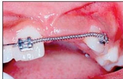
Figure 4. Recovered space.

Spontaneous eruption of the maxillary left central incisor was expected during the subsequent four months. Since eruption did not occur a partial fixed appliance was fabricated because the patient was in the mixed dentition stage. The appliance, with a push coil spring, was attached using brackets bonded to teeth adjacent to the edentulous space using light-cured composite to accomplish alignment of the teeth, space recovery, and leveling of the dental arch (Figure 4).