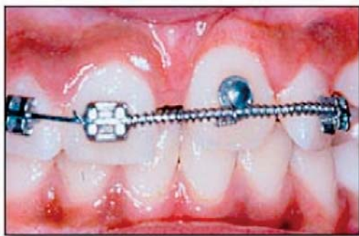
Figure 5. Tractioned incisor.

Despite the recovery of space following eight months of treatment with the partial orthodontic appliance spontaneous eruption of the maxillary left central incisor failed to occur. Treatment was then altered to include orthodontic traction and the surgical exposure of the crown of the impacted tooth was accomplished. Later, bonding of the button to the traction appliance was done in the same way as the original orthodontic appliance brackets. The orthodontic button with an extension of the ligature wire was bonded to the buccal surface of the maxillary left central incisor. Light and extrusive forces were applied with an elastic ligature until the tooth reached the desired position and favorable positioning in the arch was possible (Figure 5).