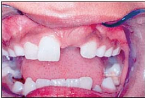
Figure 1. Initial frontal view of the mixed dentition.

A 10-year-old boy presented to the Children's Dental Clinic of the Dental School at the Federal University of Pelotas in Pelotas, RS, Brazil. His only complaint was the lack of the maxillary left central incisor which bothered him because it was not esthetically acceptable. A clinical examination revealed a balanced face, good oral health, an Angle Class I malocclusion, a mixed dentition, lack of the maxillary left central incisor, and the loss of space caused by the inclination of the teeth that were adjacent to the space of the retained tooth (Figure 1).