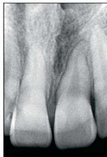
Figure 7. Final periapical radiograph.