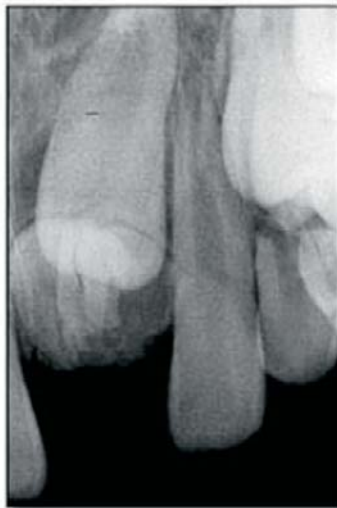
Figure 2. Initial periapical radiograph.

A radiopaque mass was found on a periapical radiograph (Figure 2). Using the radiographic localization technique described by Clark 10 the