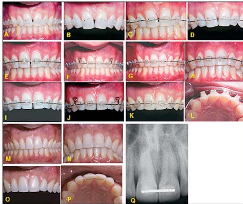
Figure 2. A-D. Re-treatment with the brackets positioned correctly and a .0175" coaxial arch wire correcting the problem at initial stages of treatment. E-L. Rectangular arch wires with closing loops associated with elastomeric chains helped to close the black triangle. M-P. Finished case with teeth inclination achieved. Spaces maintained distally of lateral incisors for composite restoration. Q. Ideal root parallelism and retention wire bonded on the lingual surface of maxillary central incisors.

Figure 2 shows the correct way to close a "black triangle" and achieve root parallelism when orthodontic brackets were positioned correctly, along with a 0.0175 coaxial arch wire at the initial stages of treatment. Closing loops associated with elastomeric chains were used. Ideal root parallelism was achieved and retention was provided by a wire bonded on the lingual surface of maxillary incisors.