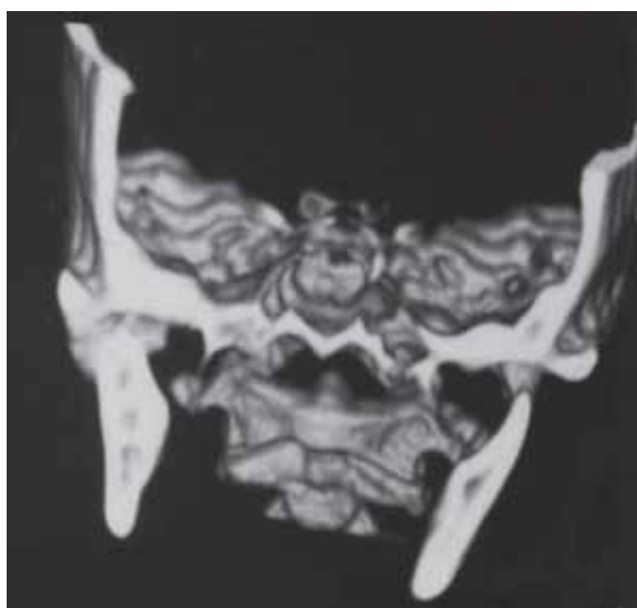
Fig. 1: Preoperative 3D CT scan showing ankylosed TMJ

It is imperative to identify the bony landmarks like sigmoid notch, the posterior and the anterior border of ramus. First, the lower osteotomy cut was made below the sigmoid notch starting from the anterior to the posterior border. Approximately, two-third thickness of the bone was cut with the bur and the remaining one-third of the bone was split with an osteotome to prevent damage to the internal maxillary artery. The second osteotomy cut was made approximately at a distance of 1.5 cm above the lower cut and extended from the lower edge of sigmoid notch from anterior to the posterior border of ramus diverging posteriorly from the first cut. This modification of the standard gap arthroplasty procedure eliminated the need for separate coronoidectomy and allowed the ankylosed mass along with elongated coronoid process to be removed in one piece (Fig. 3). Mouth opening was checked using