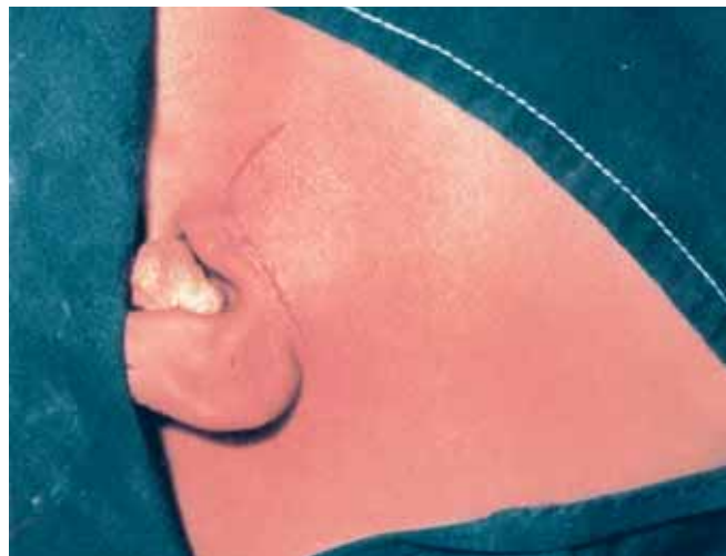
Fig. 2: Modified Myrhaug's preauricular incision

In all the cases, the joint was approached by modified Myrhaug's preauricular skin incision (Fig. 2). Here, Myrhaug's incision was modified by extending the anterior part of its horizontal extension more forwards and downwards to prevent nerve damage and better surgical exposure.