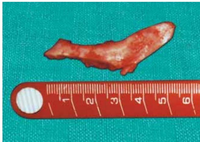
Fig. 4: Osteotomized mass including coronoid process

One of the positive factor influencing the success is sufficient wide surgical exposure. 23,24 Regardless of the surgical approach used to gain access to the TMJ, the final dissection places the facial nerve at risk for damage. 25 A loss of function of the frontalis and orbicularis oculi muscles is always a possibility. 26 The incidence of complications such as permanent injury of the facial nerve is very low, 7 with rate varying from 9 to 18% 27 and 1.5 to 32%, 24 usually disappearing within 6 months. In this study, modified Myrhaug's, preauricular approach was employed in all 10 cases. Although this incision was used by Myrhaug exclusively to expose the articular eminence for eminectomy