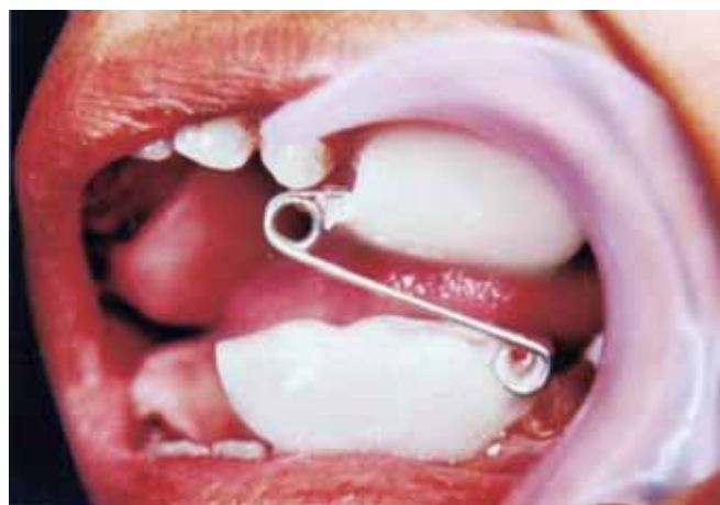
Fig. 5: Custom made intraoral mouth opening exercise device

procedure, it was further modified by extending the anterior part of its horizontal extension slightly forwards and downwards. This incision was advantageous as it allowed excellent visibility of the ankylosed joint along with the exposure of invariably elongated coronoid process and preservation of most of the vital anatomical structures surrounding the joint especially the zygomatic and temporal branches of the facial nerve and masseteric nerves and vessels.