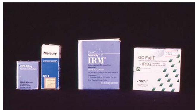
Fig. 3: Dental amalgam and IRM