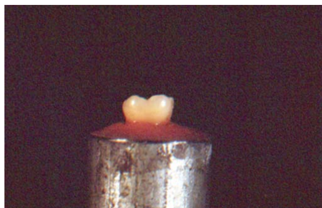
Fig. 2: Cementoenamel junction

Testing for fracture resistance was done at the material testing division of Automotive Research Association of India (ARAI), Pune, using Instron 1195–Universal testing machine compressive mode (Fig. 5). Sample was placed on loading platform, compressive pressure was applied at crosshead speed of 0.5 mm/min using a ball ended plunger touching the central fossa of tooth uniformly (Figs 6A and B). Failure was detected by fracture of the sample. Readings were obtained graphically which were interpreted numerically.