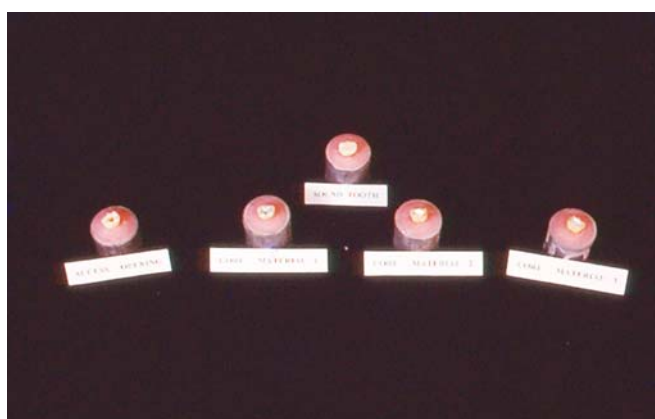
Fig. 4: Lathe cut iron rings