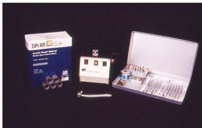
Fig. 1: Self-cure acrylic resin