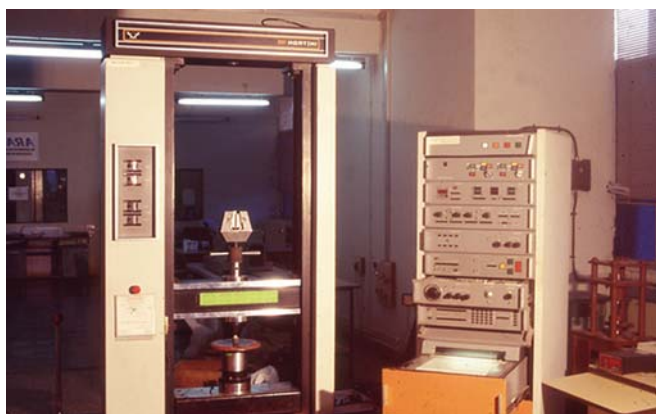
Fig. 5: Instron 1195—Universal testing machine

Tooth restoration is the final step in root canal treatment. 10 Numerous studies have been conducted to determine the ideal method to restore endodontically treated teeth as these teeth have decreased fracture resistance due to the loss of tooth structure during endodontic access and cavity preparation procedures. Cusp separation rarely occurs in noncarious, intact teeth because of the presence of the pulp