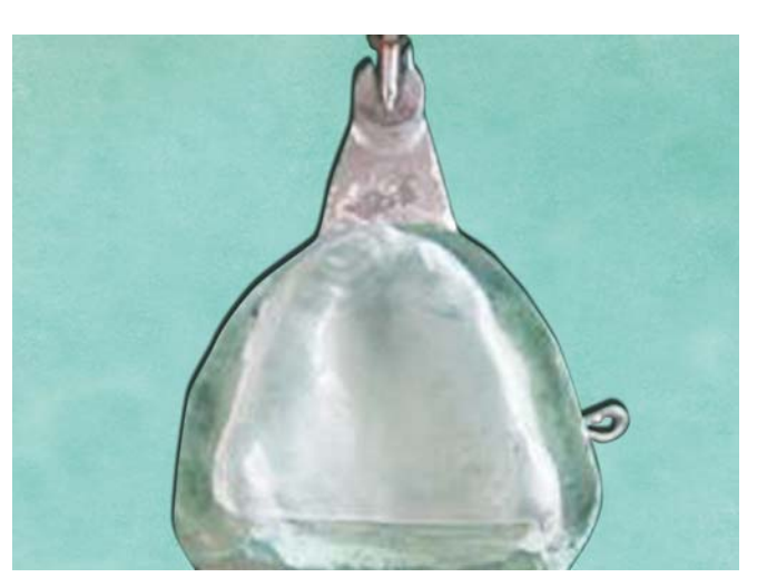
Fig. 3: The vacuum formed 0.020 coping placed on the master cast

Phonetics is one of the important factors in complete denture construction. Frequently, however, this factor is neglected