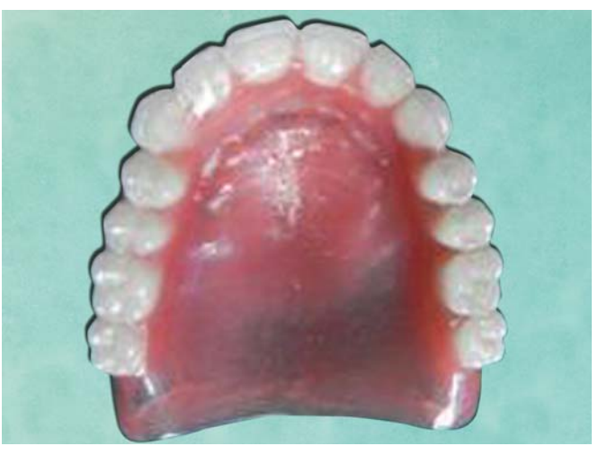
Fig. 5: The final denture with customized rugae and palatal contours