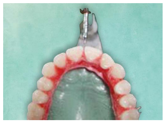
Fig. 4: Palatal portion of the trail denture has been removed by cutting the denture base placed on the master cast