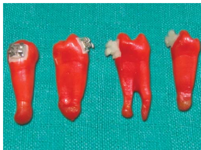
Fig. 1: All the samples were brushed with nail polish except 1 mm boundary around the brackets

Then, the apices of all the teeth were sealed with wax gum. All the samples were brushed with nail polish except 1 mm boundary around the brackets (Fig. 1). The teeth were immersed for 24 hours in 0.5% fusion solution (Ghatran Co) at room temperature. The 0.5% fusion solution was prepared by dissolving 1 gram fusion powder in 200 ml of distilled water. The teeth were removed from the solution after 24 hours, washed with water and the surface color was removed by a toothbrush. The teeth were then dried and placed in acrylic resin blocks (Fig. 2). With the use of a special disk and cutting machine, two longitudinal