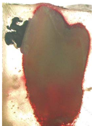
Fig. 3: No bracket-adhesive or adhesive-enamel color penetration (group 0)