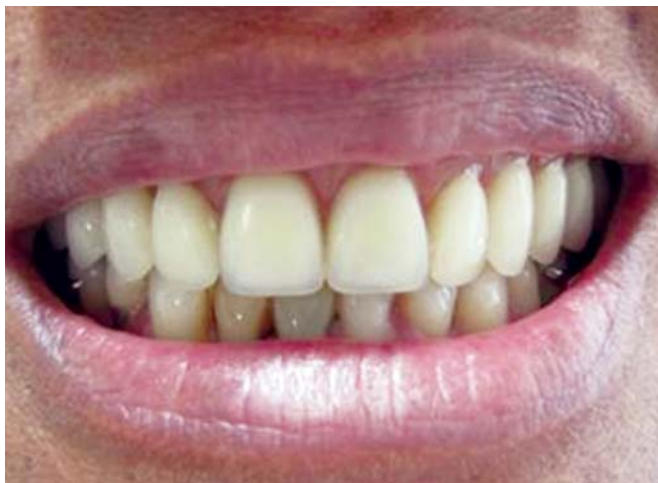
Fig. 9: Oral rehabilitation: Branemark protocol