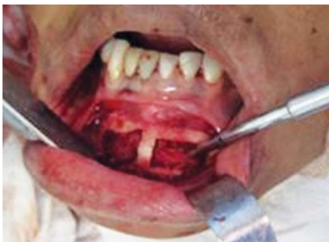
Fig. 2: Chin exposure

lyophilized bovine bone as a guarantee of greater volume for the area to be grafted. This approach would prevent the opening of a third surgical wound or a second surgical procedure to perform a new bone graft and would provide the filling for both cavities in the maxillary sinuses.