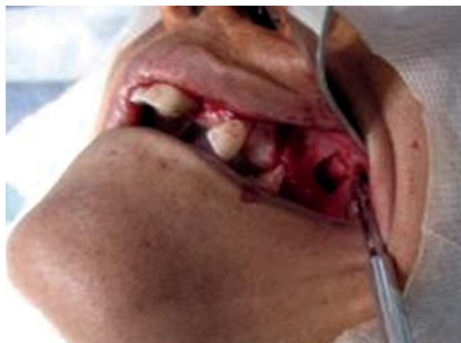
Fig. 1: Access to the left maxillary sinus

Based on this diagnosis, it was decided to complement the autogenous bone taken from the patient's chin area with