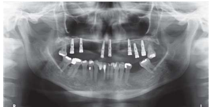
Fig. 8: Postoperative radiological examination of the installed implants

Six months after the surgery, which was the estimated time for osseointegration, the cicatrizers were installed and a Branemark protocol-style implant was made, which satisfactorily met the expectations of the patient (Fig. 9).