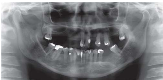
Fig. 4: Preoperative radiologic examination. Pneumatized maxillary sinuses; the bone heights were considered insufficient to anchor the implants