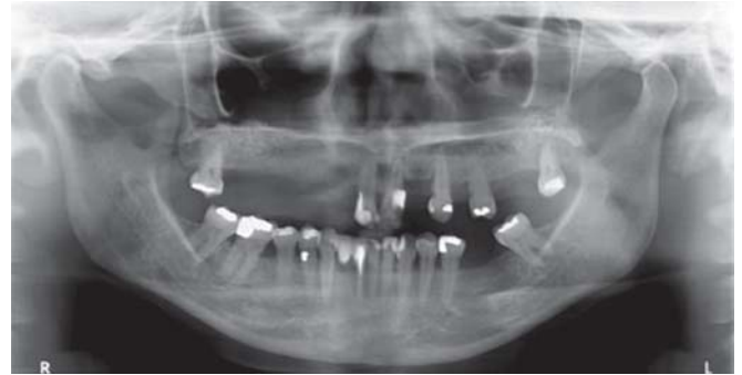
Fig. 6: Radiological examination of the patient's postoperative condition