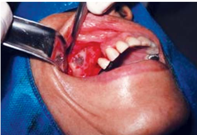
Figs 3A and B: Filling the cavity of the maxillary sinus