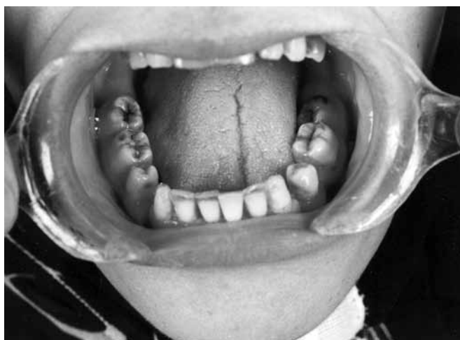
Fig. 1: Clinical picture after mandibular subapical surgery. Note remaining space in osteotomy site

and fixation was the sequence if needed. Incision of soft tissue was vestibular, and we did not use tunnel technique. The difference of our surgical method with classic Lefort I was peripterygoid canal osteotomy, fracture of pterygoid processes and send them backward or remove them and tuberosity resection in a block form, as these three more steps can harden surgery for posterior repositioning of maxilla. During surgery, we paid special attention to avoid injury to greater palatine artery. For fixation, we used four miniplates, (L shape) in pyriform and a straight plate with three holes in zygomatic buttress. After ramus osteotomy, we did rigid internal fixation (RIF) for all cases with three bicortical miniscrews in each side. For six patients, advancement genioplasty after ramus osteotomy was performed, and we moved chin 3 to 5 mm forward. The reason for advancement genioplasty after bimax surgery is that in contrast to segmental surgery, by this method, chin moves posteriorly after mandibular setback and there is a need for advancement genioplasty. After bimax surgery, 1 week IMF was done for all the patients and soft diet was recommended after release of IMF for 1 month.