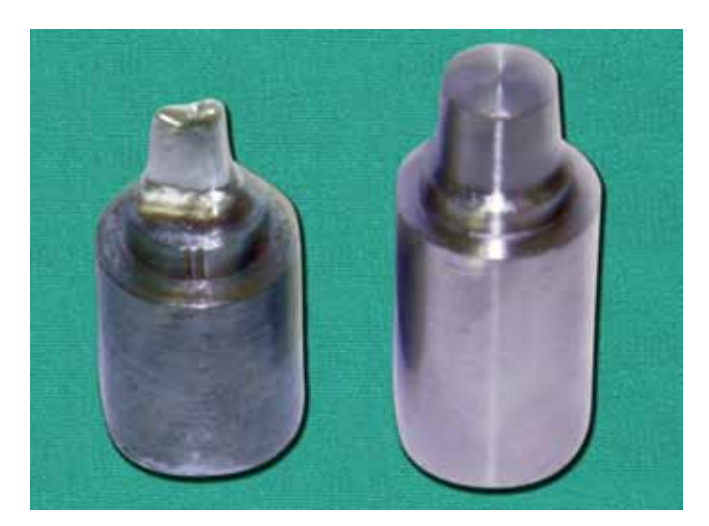
Fig. 1: Metal cast 1 and 2

To perform the impressions, sixty individual trays with a height of 35 mm and diameter of 20 mm were constructed from PVC tubes. After the cylinders were cut in the appropriate size, one of the edges was sealed with an acrylic resin circular plate and two perforations were done 5 mm below to provide retention of the heavy material. In the other edge two grooves were created to allow the withdrawal of the master cast after the impression was performed (Figs 2A and B).