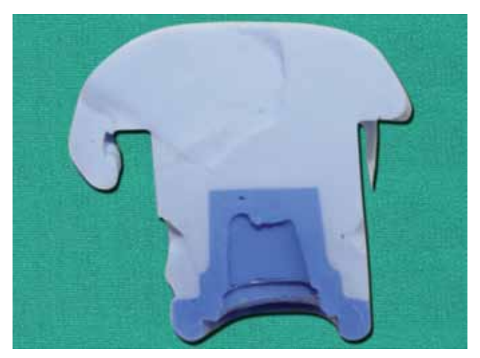
Fig. 3: Mold sagittal view: one of the master model (metal cast 2) was 2 mm larger than the other master model (metal cast 1) to provide a uniform relief for the two-step putty-wash impression technique (Aquasil - Dentsply)

Mean values and standard deviations were calculated and were analyzed with the software Bioestat 5.0 (Mamirauá Institute, Amazonas, Brazil). Initially all obtained data underwent a normality test (Shapiro-Wilk test), followed by the two-way analysis of variance (ANOVA) to verify intra and inter groups differences. Significance level was adopted at 5% and all results were considered significant when p \le 0.05 .