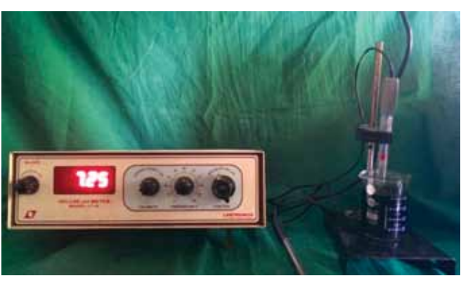
Fig. 3: Portable standard digital pH meter (Deluxe Labtronics LT 10, Haryana, India)

Sucrose was seen to be present in Syr. Combiflam<sup>®</sup> in the mean concentration of 35.75\% \pm 0.25\% and in Syr. Visyneral in the mean concentration of 18.48\% \pm 0.43\% , whereas Syr. Augmentin<sup>®</sup> Duo, Syr. Valparin<sup>®</sup> and Syr. Orofer<sup>®</sup> were devoid of sucrose content (Table 2).