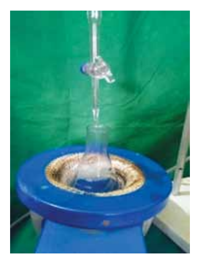
Fig. 2: Lane-Eynon test for sucrose estimation-titration of the Fehling's solution by the medicine sample in burette