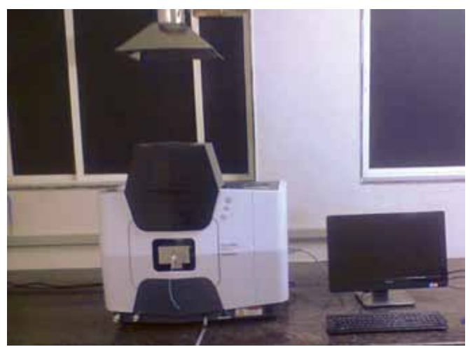
Fig. 5: Atomic absorption spectrometer (Shimadzu Model no. AA 7000, Maryland, North America)