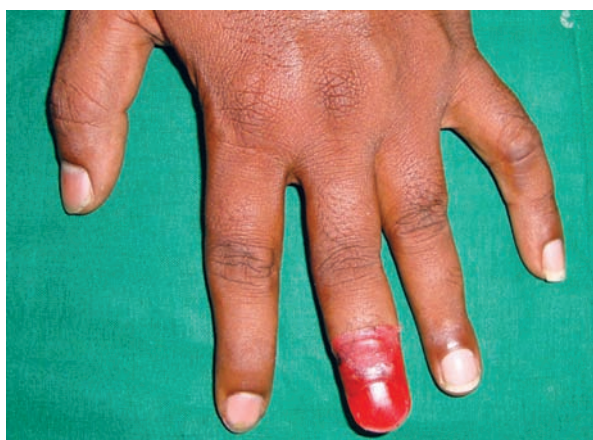
Fig. 3: Wax pattern on the meshwork

and mold space left after removal should be poured with pattern resin and rest of the impression poured with type IV dental stone. The cast should be removed from the impression, layered with modeling wax (to create space for the silicone material to flow) and duplicated with agar material. Phosphate bonded refractory material should be poured into the negative mold of agar to replicate the amputated finger, the refractory cast removed and a pattern for mesh work adapted and casted with cobalt chromium metal alloy (Fig. 2). Considering the contralateral finger as control a wax pattern for the missing phalange should be adapted on the metal frame work along with a provision for the finger nail and wax trial should be done (Fig. 3). The wax pattern along with the metal frame work should be secured to the pattern resin (area simulating the O-ring) of the cast using resin modified glass ionomer cement and flaked using type IV dental stone. Lost wax technique can be used to create the mold, after which the framework secured in the mold (as it is cemented to the pattern resin) should be coated with an oil paint to mask the color of the metal. Silicone should be mixed as per manufacturer's instructions and intrinsically stained in order to match the color of dorsal and ventral surface of the hand, (Fig. 4) and layered into the mold, transferred