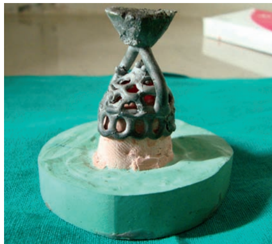
Fig. 2: Fabrication of meshwork for picking up of O-ring