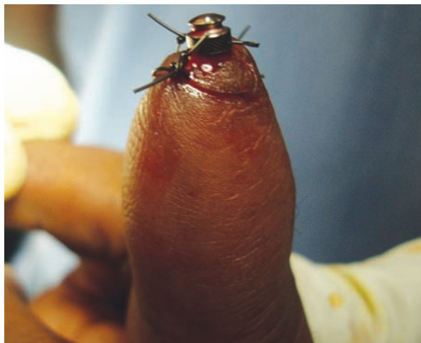
Fig. 1: Flaps sutured with O-ring in position