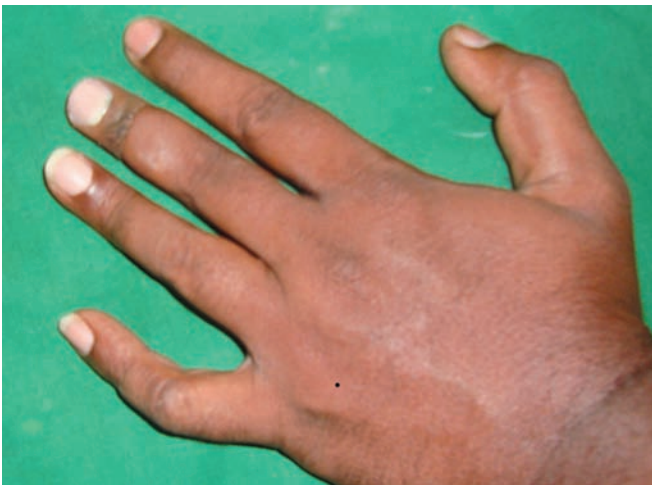
Fig. 5: Final prosthesis with external pigmentation

osseointegrated implant. However, the major limitation of the present design is its limitation for amputations that involve single phalange (i.e. distal phalange).