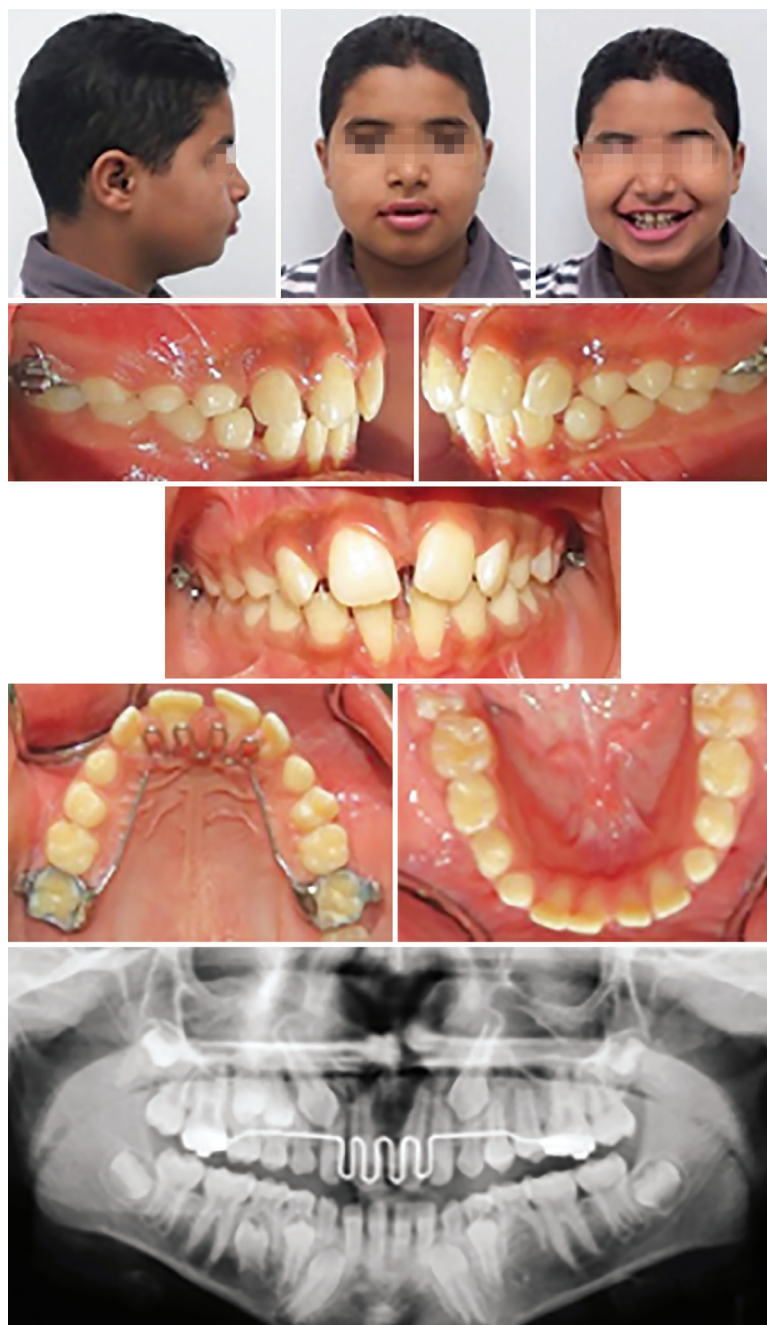
Fig. 2: Clinical photographs and panoramic radiograph after 7 months of treatment

Two years post-treatment evaluation of the patient (Fig. 3) revealed good stability with more reduction in incisor spaces due to the eruption of permanent maxillary and mandibular canines. The patient referred for extraction of mandibular right primary second molar to stimulate eruption of its successor. Upon completion of eruption of permanent teeth, a second stage of treatment may be indicated with treatment objectives limited to alignment of incisors and closure of remaining spaces. Pretreatment and 2 years post-treatment lateral cephalometric radiographs and analysis results (Fig. 4) showed the significant improvement in facial profile, lip competency, incisors inclination and NLA angle.