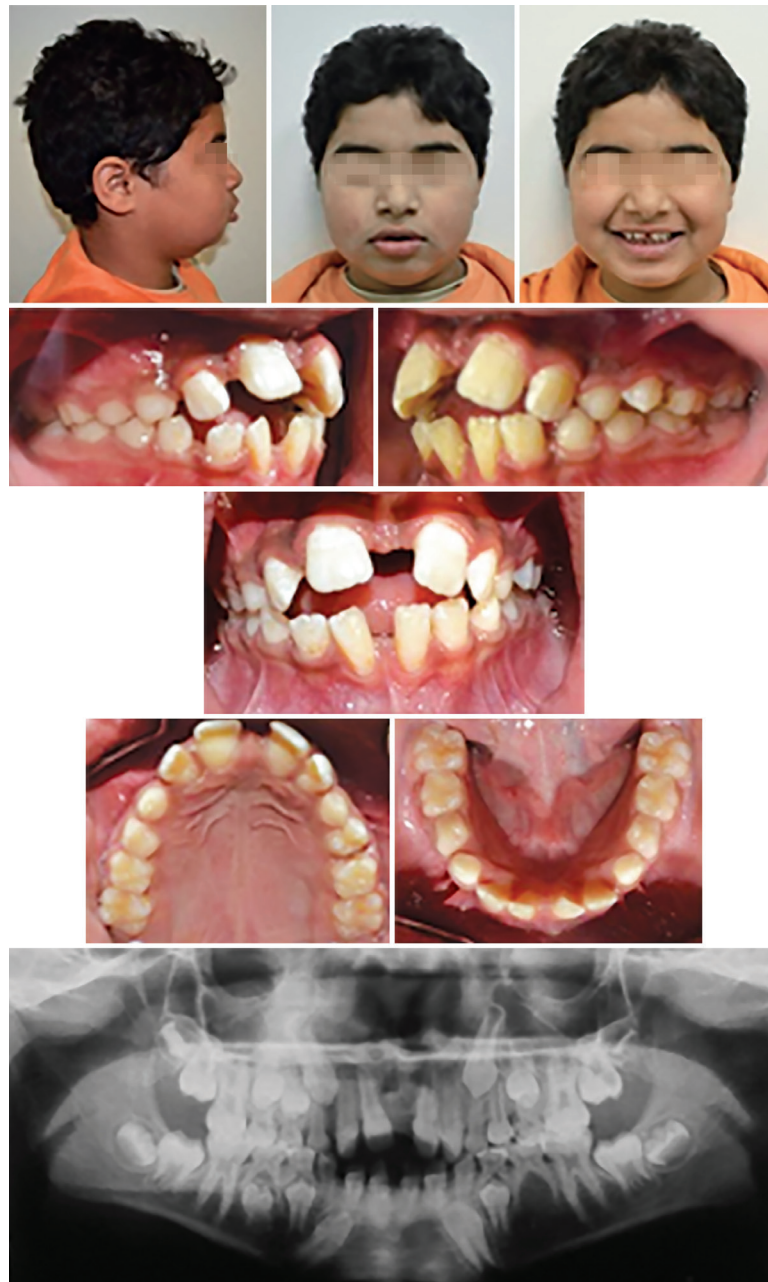
Fig. 1: Pretreatment clinical photographs and panoramic