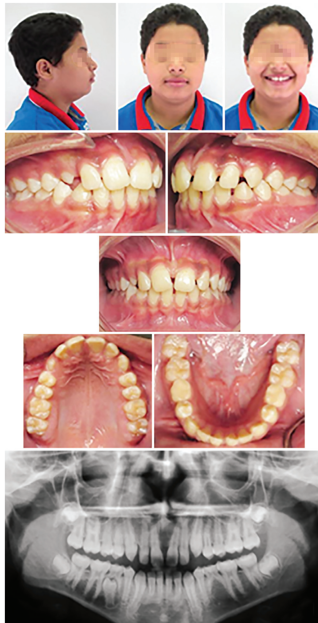
Fig. 3: Two years post-treatment clinical photographs and panoramic radiograph