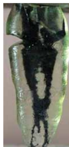
Fig. 4: Cleared tooth after dye penetration