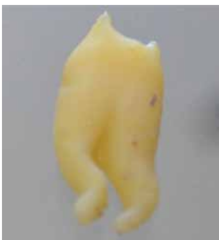
Fig. 3: Completely demineralized tooth after 72 hours of immersion in 5% nitric acid