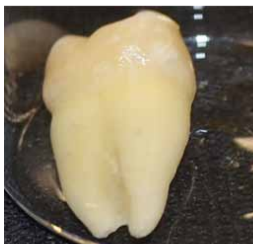
Fig. 1: Tooth before decalcification