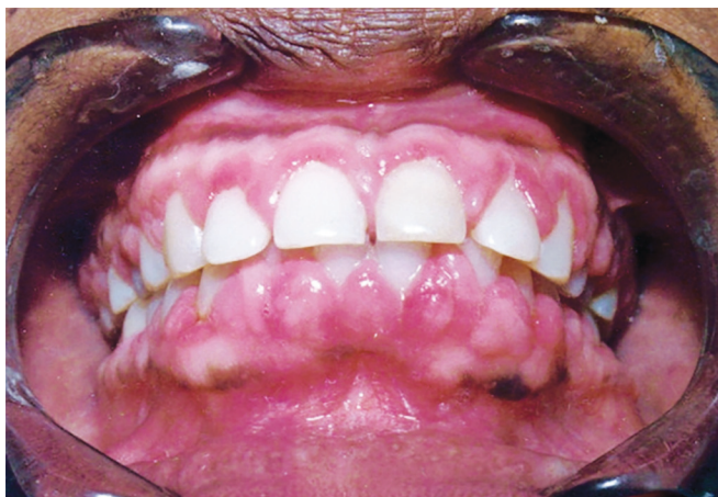
Fig. 1: Initial presentation

Due to the poor oral hygiene status of the patient, he was advised meticulous oral care and weekly professional prophylaxis. The patient was advised oral folic acid supplementation (0.5 mg/day) and was also recommended 0.2% chlorhexidine gluconate mouthwash twice daily. Oral hygiene instructions and dietary advice were provided to the patient. Professional prophylaxis was repeated the following week. The gingival hyperplasia had reduced significantly in the following week. This was especially evident in the labial gingiva of the mandible. Treatment was completed over a period of 4 weeks and a good esthetic result was achieved. As the gingival hyperplasia had regressed significantly, further gingival surgery was not considered.