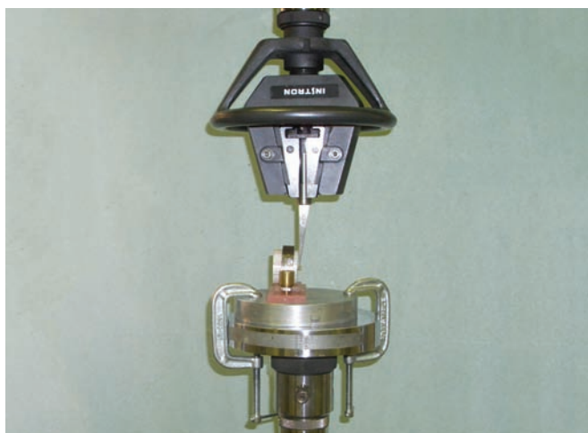
Fig. 1: Shear bond strength test specimens in the universal testing machine