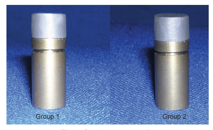
Fig. 4: Castings on master die

The castings of the ringless technique provided less vertical marginal discrepancy (240.56 \pm 45.81 \mu) than