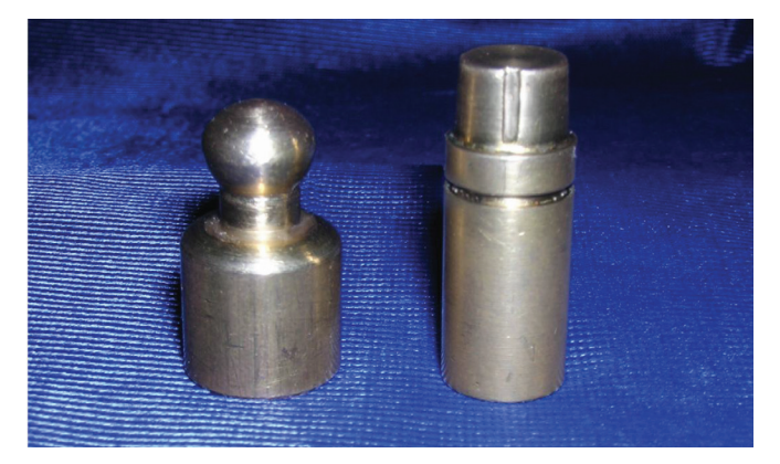
Fig. 1: Master model with counter die

Group 1: The first group was invested with Bellavest T (BEGO, Bremen, Germany) phosphate-bonded investment. A single layer of ceramic liner was adapted to the 1× casting ring and moistened by dipping in a bowl of water, and the excess water was shaken away. Bellavest T phosphate-bonded investment (60 gm of