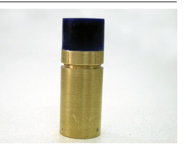
Fig. 2: Wax pattern on master die

To simulate a complete molar crown preparation a precisely machined brass master die was designed. The die had a 6° taper toward the occlusal surface from the finish line and measured 6 mm from the occlusal surface to finish line. Mounting of the metal die was done on a cylindrical base of 10 mm diameter and 20 mm length. For orientation of casting during seating a shallow axial groove was given. On the root stump near the cervical margin around the circumference of the die, four reference marks were scribed, one each on the buccal, lingual, mesial, and distal surfaces. These were used later as reference marks for the measurements. In order to make wax patterns of uniform dimensions, a counter-die with dimensions 1 mm larger than the master die was made<sup>16</sup> (Fig. 1).