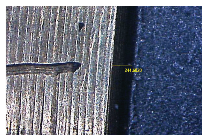
Fig. 5: The marginal discrepancy between the metal die and the casting was measured on an optical stereomicroscope