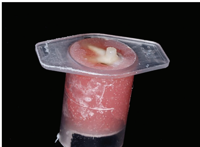
Fig. 1: A prepared sample

Due to lack of studies in this field and also for determining the best time for TA application, we performed a pilot study. The result of the pilot study showed that the