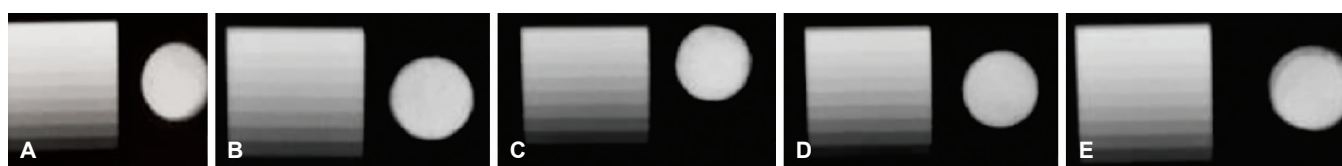
Figs 1A to E: Radiopacity in the different experimental groups: (A) WMTA + NPP; (B) WMTA + NP22 ppm; (C) WMTA + NP30 mm; (D) WMTA + NP50 mm; and (E) WMTA (control)

According to the present methodology and results, it could be concluded that Ag NPs changed the radiopacity of MTA, but all were above 3 mm Al. The radiopacity in descending order was: WMTA + NPP, WMTA + NP30, NP22 + WMTA, WMTA + NP50, and WMTA (control).