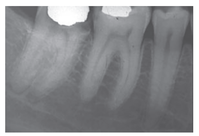
Fig. 1: Preoperative X-ray: Right second lower molar with secondary caries and pulpitis

reference is made to the use of a single-file instrument in the shaping step, but to complete the canal shaping more than one endodontic instrument is necessary. Scouting with manual stainless steel instruments is an indispensable initial step of canal preparation, which facilitates familiarity with the root canal and establishes the working length (Figs 1 and 2). Preflaring with dedicated rotary nickel titanium instruments quickly eliminates all interferences in the coronal third of the root canal, allowing rectilinear access for subsequent mechanical instruments. Dedicated rotary nickel titanium instruments for glidepath management are the first mechanical instruments to reach the full working length, creating a safe path for the mechanical instruments used for the actual shaping. In this way, the shaping step is safer and can be performed with a multifile or single-file sequence and in any case with a single-length technique. At this point, the apical preparation diameter may be verified and finally, if necessary, apical finishing performed, which provide adequate groove filling (Fig. 3).