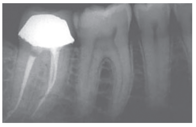
Fig. 3: Postoperative X-ray: Root canal treatment and a full porcelain-fused-to-metal crown

the canal allows, without therefore wishing to reach the set working length immediately. The working length is reached progressively, and the apical preparation diameter is established.