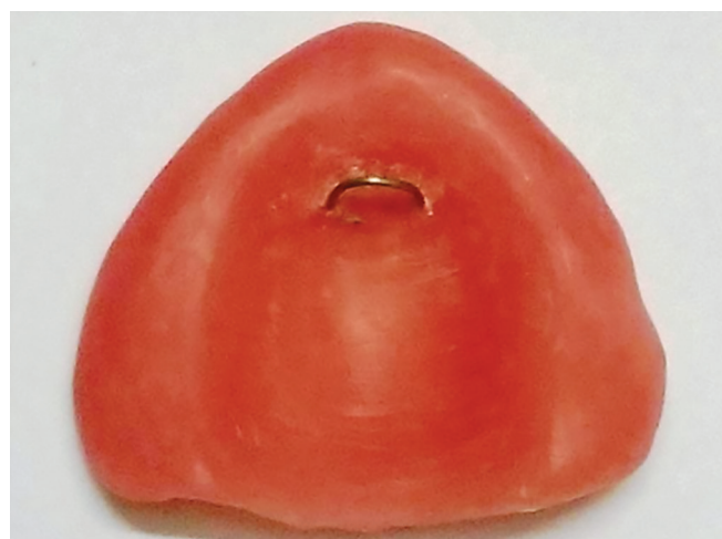
Fig. 1: Finished denture base with wire loop at the anterior palatal region