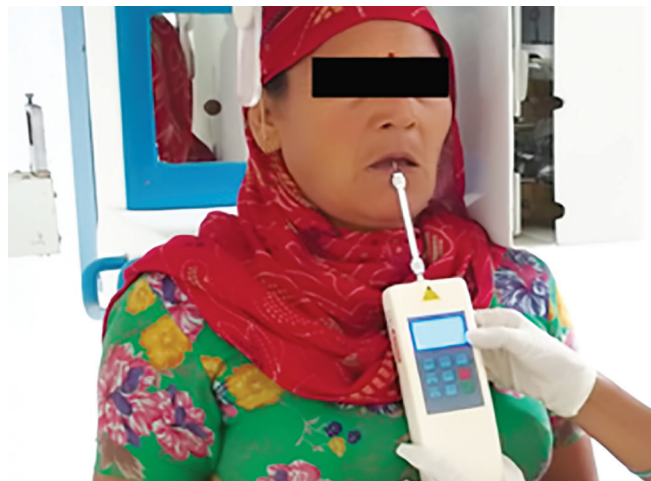
Fig. 3: Application of vertical downward force to dislodge the trial denture base (with digital quantification)