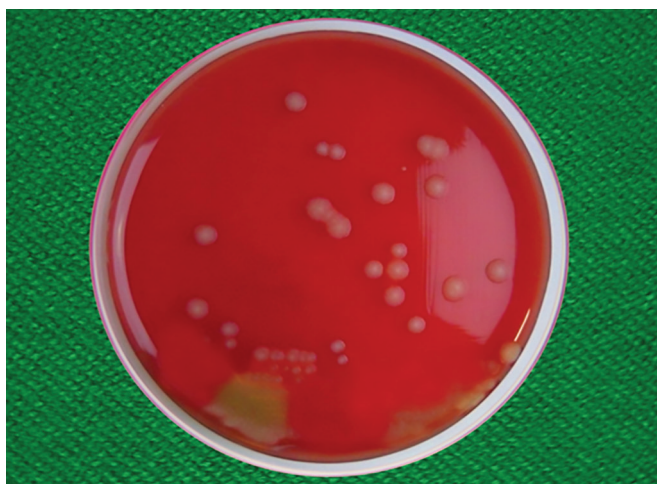
Fig. 3: Zone of inhibition of A. actinomycetemcomitans

sterile forceps, the sterile disks were impregnated with M. piperita leaf extract of 80 µL and were applied on the agar surface. The agar plates were incubated at 37°C. And 0.2% chlorhexidine used as positive control. The zone of inhibition was measured at 24 to 48 hours in millimeters, using a digital caliper.