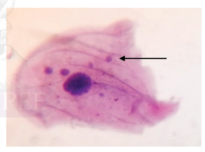
Fig. 2: PAP stained cytological smear showing micronuclei at 100× magnification