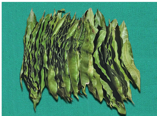
Fig. 1: Leaves of Mangifera indica L.