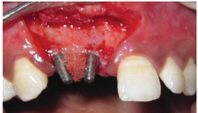
Fig. 3: Stabilization of block with titanium screw in-between two implants