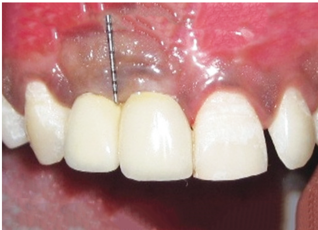
Fig. 4: Postoperative clinical view showing gain in interimplant papillary height