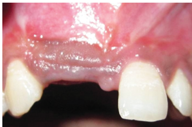
Fig. 1: Preoperative clinical view showing missing 11, 12

Clinical photograph was obtained before surgery (Fig. 1) and at 6 months and 12 months postoperatively. On the photograph, a reference line was drawn from the most apical points of gingival margins on the adjacent teeth. Similar line was reproduced postoperatively. The most coronal extent of soft tissue to reference