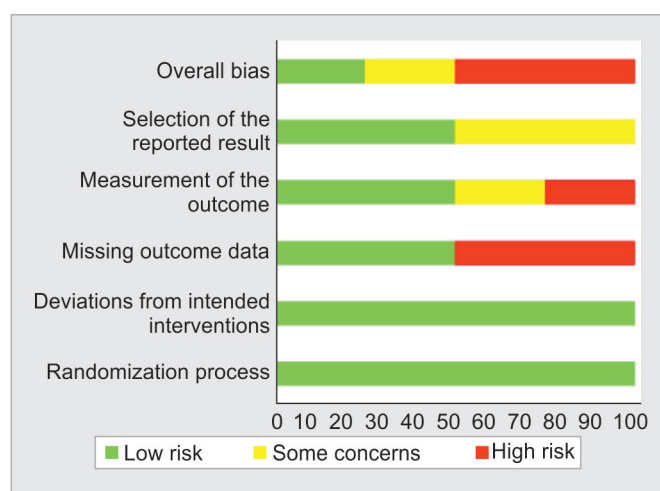
Fig. 2: Overall type of risk of bias of included studies

was no difference in marginal bone loss around implants retaining/supporting mandibular overdentures relative to implant type or attachment designs. Intra- and inter-examiner agreement could also be another influencing factor when assessing radiographic measurement of crestal bone levels. 46