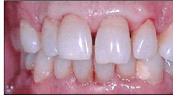
Figure 2. A second Group B patient. A. Prior to bleaching. B. One month after bleaching.