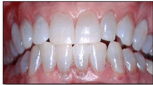
Figure 1. Group B patient. A. Prior to bleaching. B. One month after bleaching.