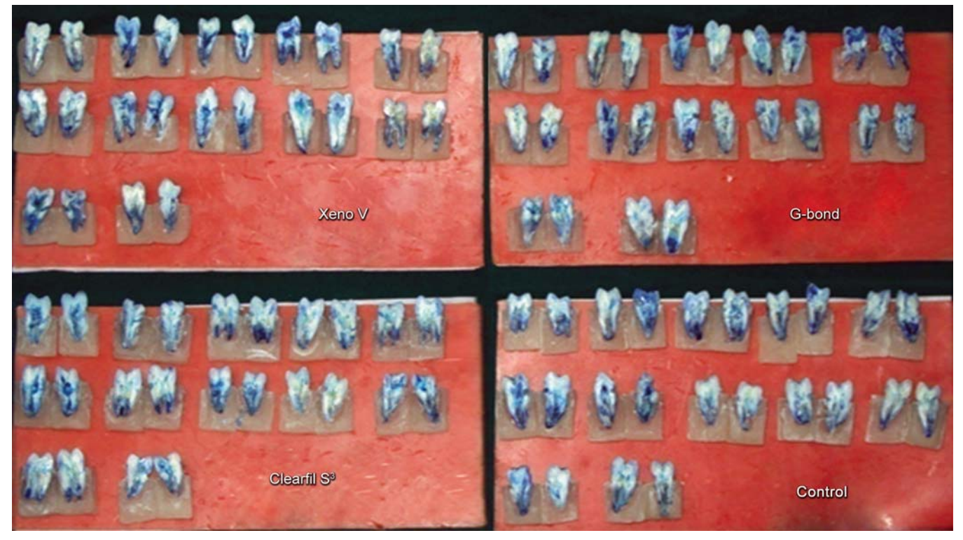
Fig. 1: Specimens after thermocycling and dye penetration

The teeth were thermocycled 500 times in separate water baths of 5°C and 55°C, with a dwell time of 60 seconds in each bath and a transfer time of 3 seconds. The root apices were sealed with utility wax, and the entire tooth surface was coated with two layers of commercial nail varnish to within 1.0 mm of the restoration. The teeth were immersed in a 1% aqueous solution of methylene blue dye for 24 hours at room temperature. After 24 hours, teeth were thoroughly rinsed to remove excess dye, then were invested in clear autopolymerizing resin and labeled. A low-speed diamond disk cooled with water was used to section the tooth block longitudinally through the center of the restoration from the facial to the lingual surface. Two sections were obtained from each block (24 sections per group). All the sections (Fig. 1) were subsequently examined using 20X stereomicroscope to evaluate the degree of microleakage around the restorations.