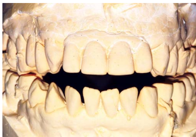
Fig. 8: Dental casts mounted in a semi-adjustable articulator