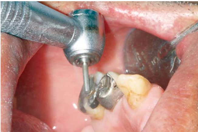
Fig. 10: Occlusal adjustment by selective grinding