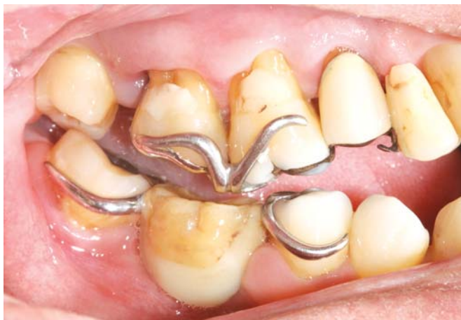
Fig. 3: Single interocclusal contact in centric occlusion (between 18 and 48)

(Fig. 8). An occlusal adjustment was then performed by the selective grinding of the casts, and good occlusal stability in the centric relation and anterior guidance within a new VDO were achieved. The final diagnosis of increased VDO class I 11 was confirmed with great pain symptoms and periodontal involvement in upper-right hemiarch. We decided to restore the physiological principles of occlusion