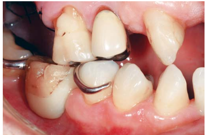
Fig. 13: Mandibular closing in the new VDO after removal of the right superior RPD clamp