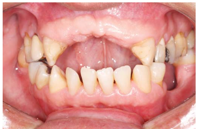
Fig. 14: Intraoral view of occlusal stability in the centric occlusal relation and new VDO