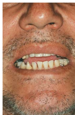
Fig. 1: Initial situation: Face too elongated and expression of tiredness

difficulty, and great difficulty chewing and swallowing. The patient reported being a mouth breather and having recurrent sinusitis. On clinical examination, we observed an elongated face and a tired facial expression (Fig. 1). He used 2 RPDs made 10 years earlier. Upon intraoral examination, teeth 14, 12, 11, 21, 22, 26, 37, 36, 35, 46 and 47 were absent. The patient also presented with an anterior open bite and the absence of anterior guidance (Fig. 2). In the centric occlusion, there was a single interocclusal contact occurring between teeth 18 and 48 and the complete absence of contacts on the left side (Figs 3 and 4). Without the RPD, there were only contacts on the right side (18 and 17 × 48) (Figs 5 and 6). During periodontal examination, teeth 18 and 17 presented deep pockets, furcation lesions, tooth mobility grade 3, and substantial bone loss (Fig. 7). In these teeth were also observed signs of occlusal trauma. The association of periodontitis and occlusal trauma lead to teeth migration because of lack of bone support resulting major occlusal discrepancies between centric relation and centric occlusion and alteration of VDO. The other teeth did not