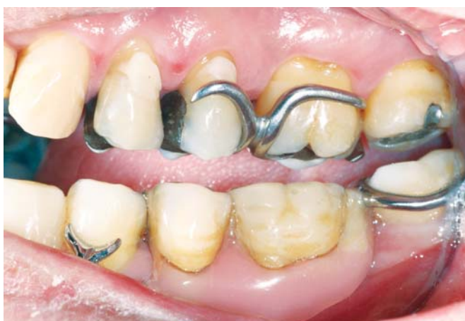
Fig. 4: Absence of contacts on the left side