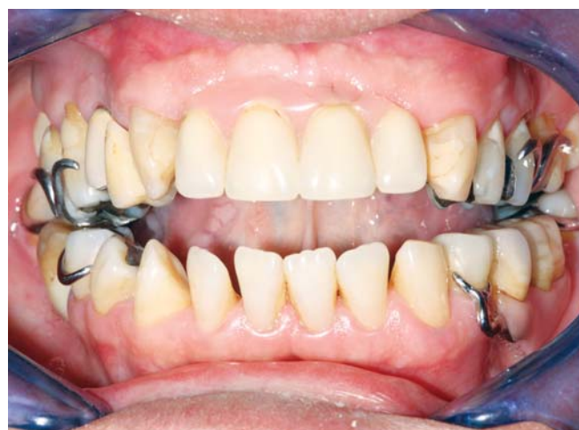
Fig. 2: Open anterior bite and absence of anterior guidance