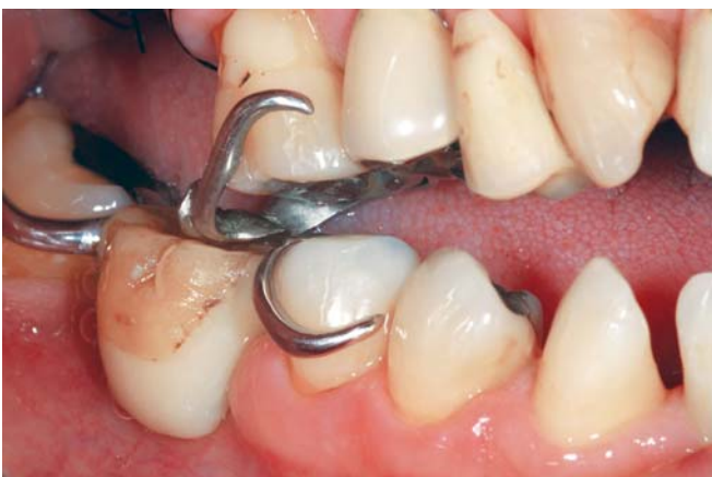
Fig. 11: Interference of RPD clamp during mandibular closing