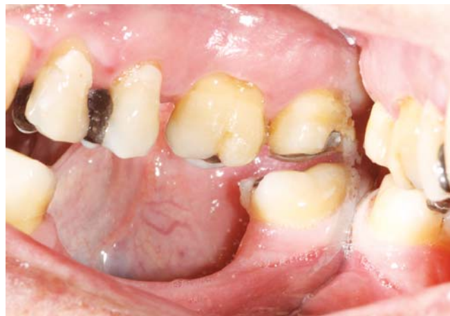
Fig. 6: Without the RPD, absence of contacts on the left side