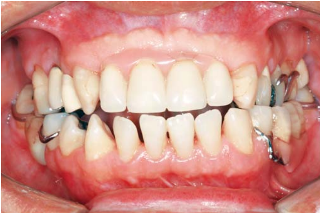
Fig. 9: Significant reduction in VDO after the extraction of 18 and 17 and partial removal of the RPD clamp

later, we conducted an occlusal adjustment by selective grinding to reduce the anterior open bite and increase the occlusal stability (Fig. 10) as been simulated in the casts. In addition, the right clasp of the RPD was completely removed (Figs 11 to 13). With these procedures, the coupling of the anterior teeth was possible, which provided anterior guidance and stability in the centric occlusal relation in the patient (Figs 14 and 15). After these procedures, the