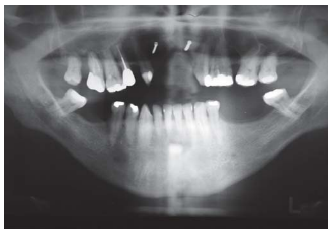
Fig. 7: Great bone loss on the right posterior