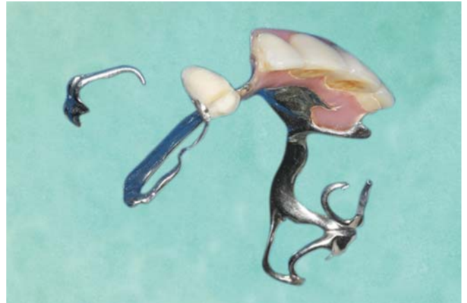
Fig. 12: Complete removal of the right superior RPD clamp