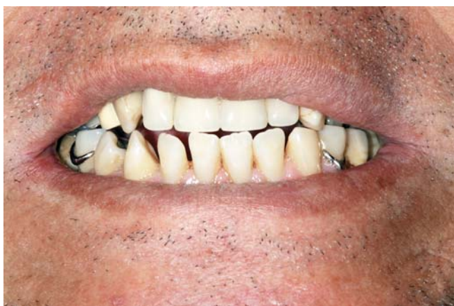
Fig. 15: Extraoral view of anterior guidance and occlusal stability in the centric occlusal relation and new VDO