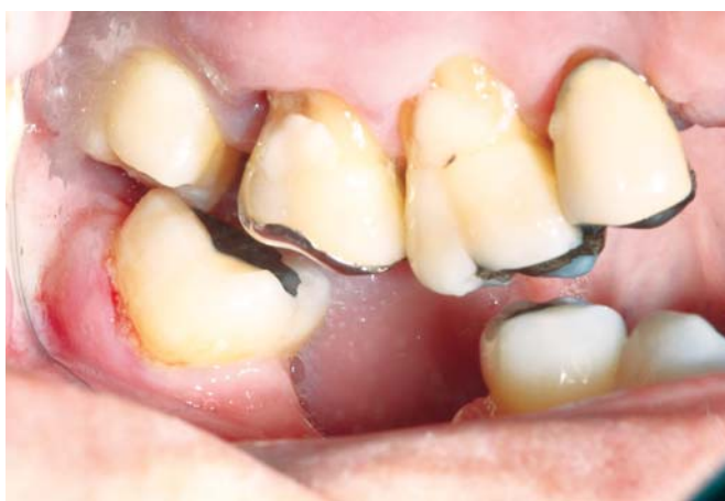
Fig. 5: Without the RPD, only contacts on the right side were observed (18 and 17 × 48)