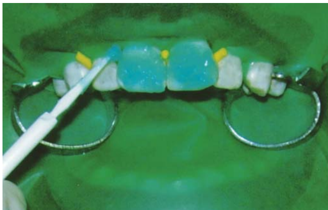
Fig. 5: The bleaching gel application to each tooth at least 2 mm in depth