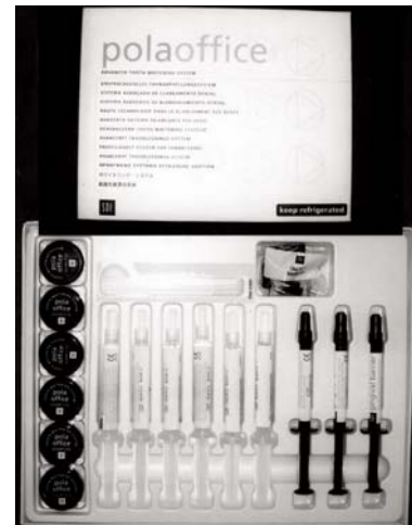
Fig. 4: Bleaching agent, 35% hydrogen peroxide (Polaoffice—dual activated advanced tooth whitening system, SDI Limited, Australia)