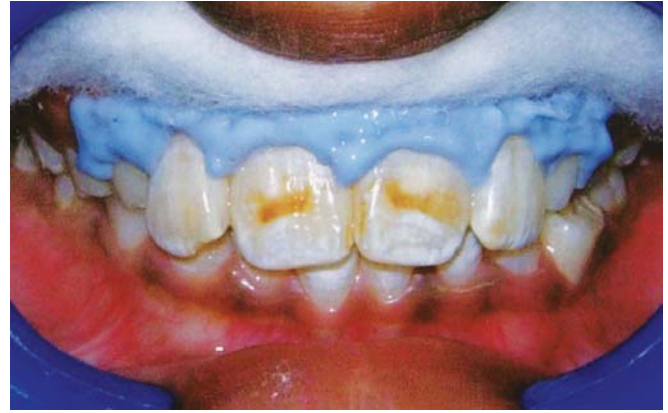
Fig. 3: Gingival barrier overlapping 0.5 mm of enamel and sealing all pink tissue