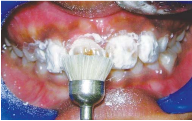
Fig. 1: Extrinsic stains removal using prophy brush and pumice paste following oral prophylaxis