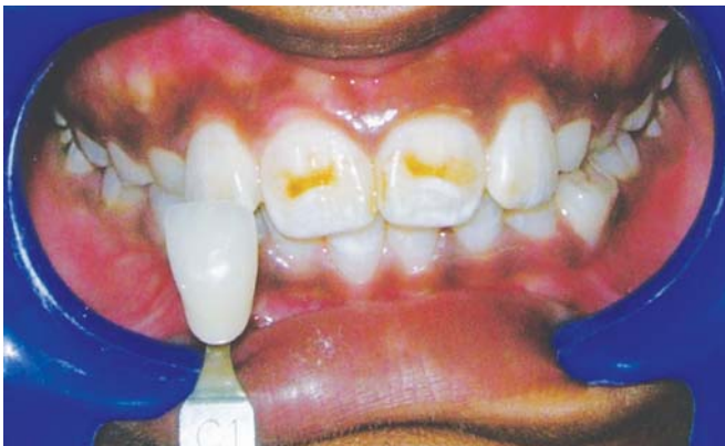
Fig. 2: Recording of baseline shade of the teeth using Vita shade guide