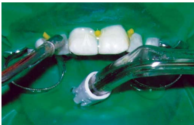
Fig. 7: After last application of bleaching gel copious amount of water spray was used to properly clean the tooth