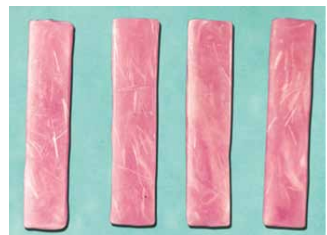
Fig. 12: Group 5 specimens

In Table 3, Conventional heat cured poly (methyl methacrylate) denture base resins give a high strength value of 10.78 joules and a low of 10.01 joules. The average value of impact strength is 10.469 joules. In Table 3, the results