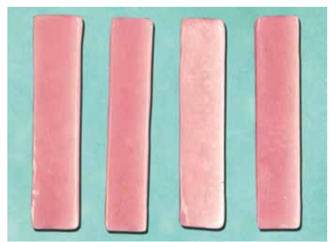
Fig. 11: Group 4 specimens