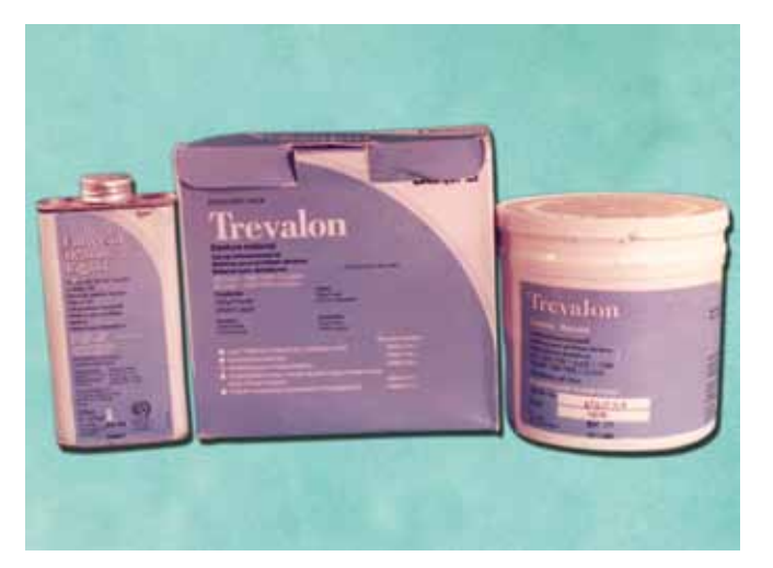
Fig. 3: Materials used for the preparation of group 3 specimens

Sixty heat cure poly (methyl methacrylate) specimens were made. Ten specimens were made for each group (Figs 8 to 13).