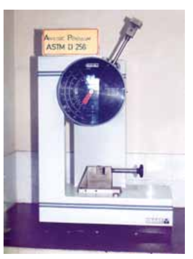
Fig. 14: Analog pendulum ASTM D256-frontal view