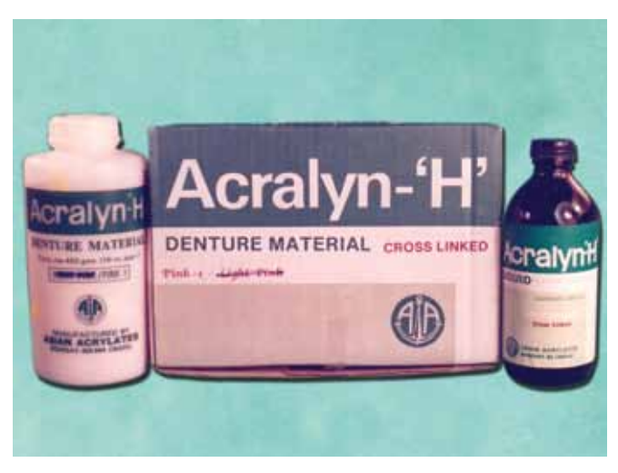
Fig. 2: Materials used for the preparation of group 2 specimens

The tests on the six groups described earlier ware conducted as per ISO – R 179 (DIN 53453 or ASTM D-256). Ten specimens were tested in each group and their compatibility was checked statistically. The results are discussed in succeeding paragraphs. It is to be noted that groups 1, 2 and 3 belong to conventional heat cured poly (methyl methacrylate)