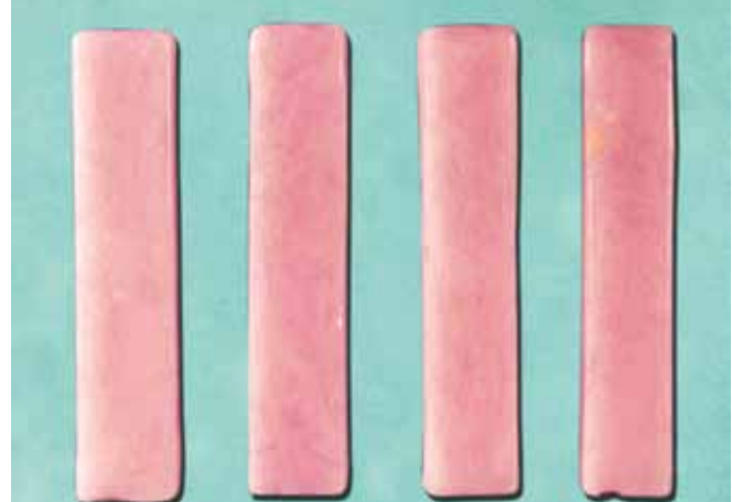
Fig. 10: Group 3 specimens