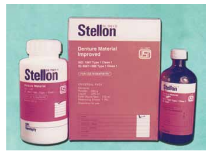
Fig. 1: Materials used for the preparation of group 1 specimens

The two halves were then separated and the M-steel rods was removed. The mold was then flushed with hot household detergent solution to remove any traces of petroleum jelly and were cleaned in boiling water.