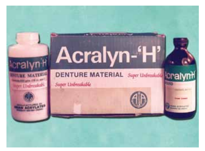
Fig. 5: Materials used for the preparation of group 5 specimens

The maximum impact strength obtained among the specimens of group 1 is 9.45 Joules while the minimum nis 9.11 Joules. A comparison of the mean of absolutely calculated of individual results is made with arithmetic mean