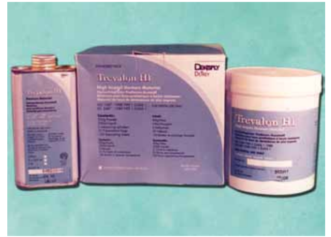
Fig. 6: Materials used for the preparation of group 6 specimens

Test results of specimens and their deviation from average value of group 2 are presented in Table 2. The maximum and minimum values of impact strength 11.94 joules and 11.43 joules respectively. The results are in good ( see Table 2).