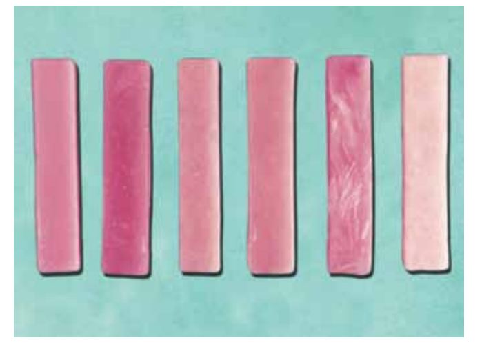
Fig. 15: Specimens of all groups (groups 1-6)

In Table 3, Conventional heat cured poly (methyl methacrylate) denture base resins give a high strength value of 10.78 joules and a low of 10.01 joules. The average value of impact strength is 10.469 joules. In Table 3, the results