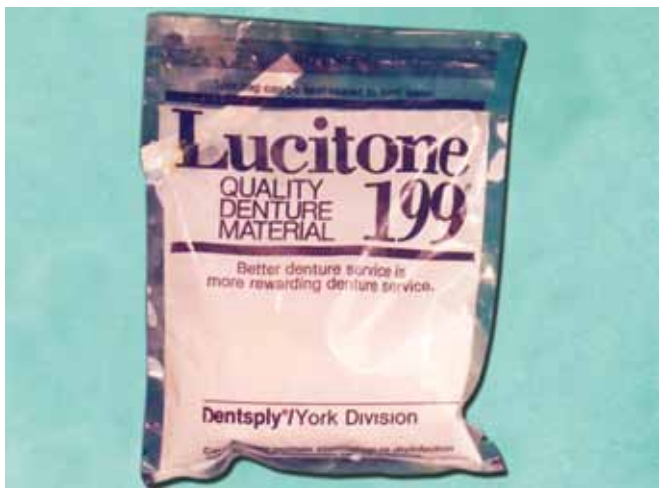
Fig. 4: Materials used for the preparation of group 4 specimens