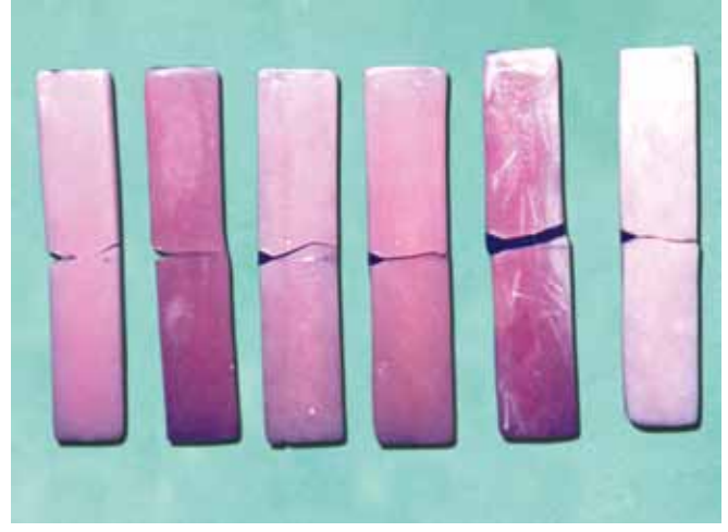
Fig. 16: Fractured resin samples (groups 1-6)

fall within permissible limits exceeding by only 1.63% from the arithmetic mean strength.