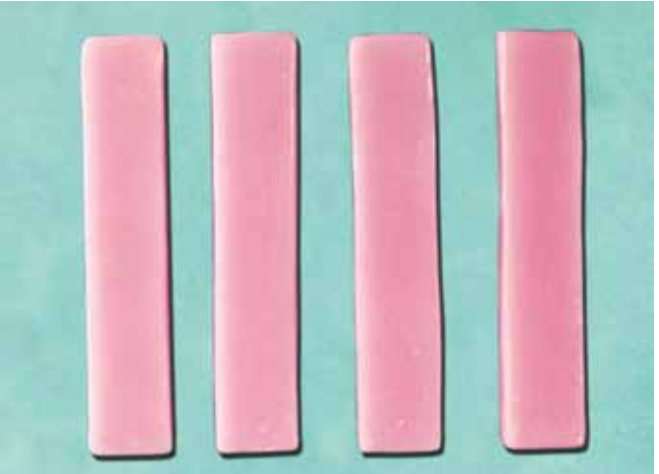
Fig. 8: Group 1 specimens