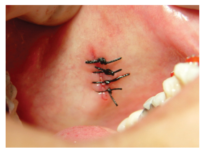
Fig. 3: The surgical area after closure with sutures

Therefore, an immediate excisional biopsy was performed. The incision for biopsy was elliptic, and the lesion was completely removed (Fig. 2) and the surgical area was sutured (Fig. 3). The removed material was fixed in 10% formalin and sent for anatomohistopathological examination, upon which the diagnosis of intramucosal melanocytic nevi was confirmed (Fig. 4).