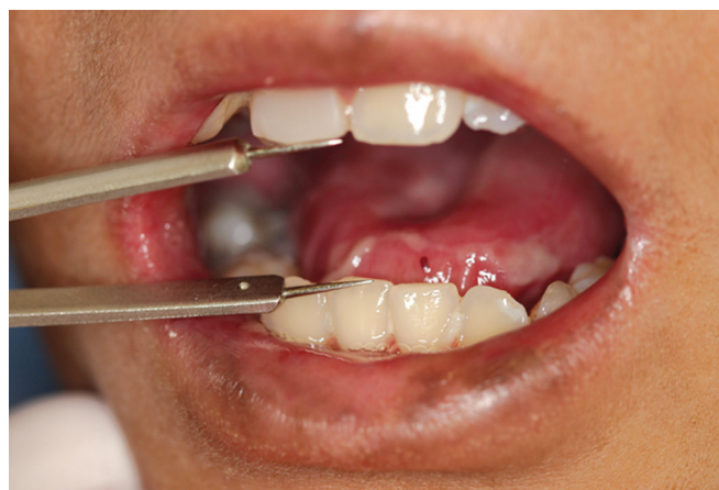
Fig. 1: Procedure used for the measurement of mouth opening

At the second visit, saliva assessment was performed considering the following sequence: Mucosa hydration test was performed by everting the lower lip and gently drying the mucosa with a small piece of gauze. With the assistance of a chronometer, time taken to observe droplets of saliva forming at the orifices of the minor salivary glands was recorded. It was considered that if the time needed was superior to 60 seconds, the resting flow rate is below normal 14 ; and nonstimulated and stimulated saliva were collected during 3 minutes each. Individuals were instructed not to eat, drink, or smoke 1 hour