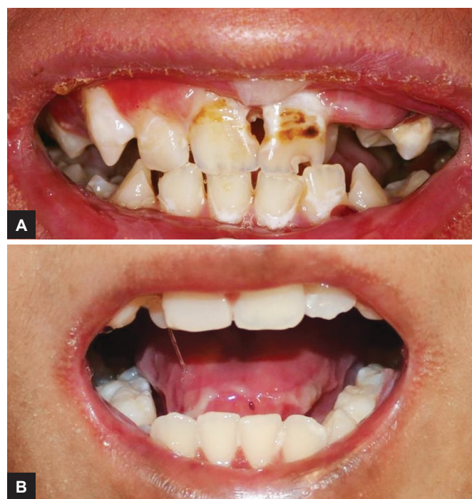
Figs 2A and B: (A) Cavitated dentine lesions present in an EB subject (top) and (B) Visible dental plaque and tongue ulcers (bottom)