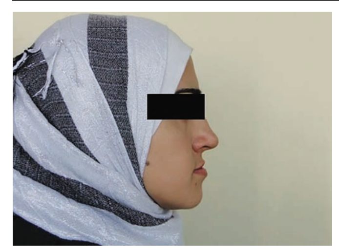
Fig. 1: Photographs showing a concave profile

the SNA angle of 77 indicated a retrognathic maxilla at low mandibular plane angle, and the incisor mandibular plane angle of 86 confirmed linguoversion of the lower anterior teeth.