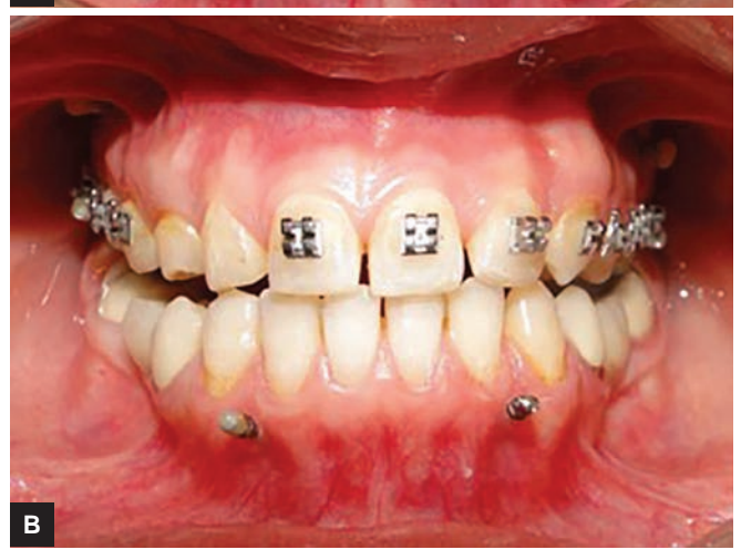
Figs 4A and B: Class 3 elastics applied on both sides

Inc., Daegu, Korea) were installed between the maxillary second premolar and molar teeth under the mucogingival line. Class 3 elastics were applied on both sides, (Figs 4A and B), gradually increasing the force to 200 gm on both sides. A posterior bite rise was used to disengage the bite. The patient continued to use intermaxillary elastics for 6 months. During this time, the upper right canine was exposed surgically with open window technique and was monitored for spontaneous eruption.