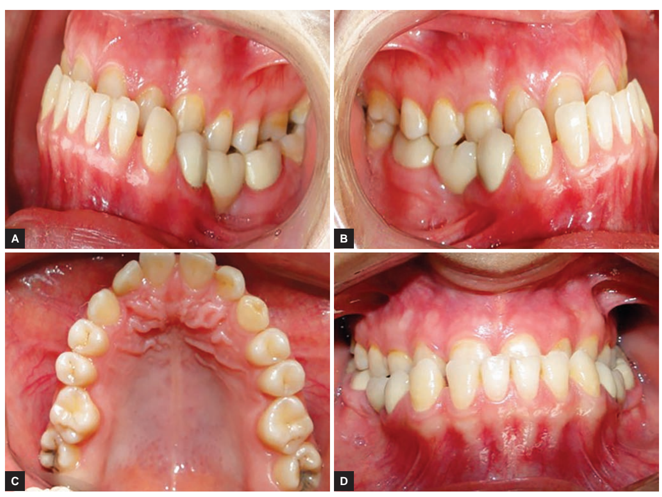
Figs 2A to D: The pretreatment intraoral photographs

The treatment plan was explained to the patient and began once she gave consent. Mini-implants (1.3 mm diameter, 6 mm length; Absoanchor; Dentos Inc., Daegu, Korea) were inserted between the mandibular lateral incisor and canine teeth on both sides. Other bilateral mini-implants (1.6 mm diameter, 10 mm length; Absoanchor; Dentos