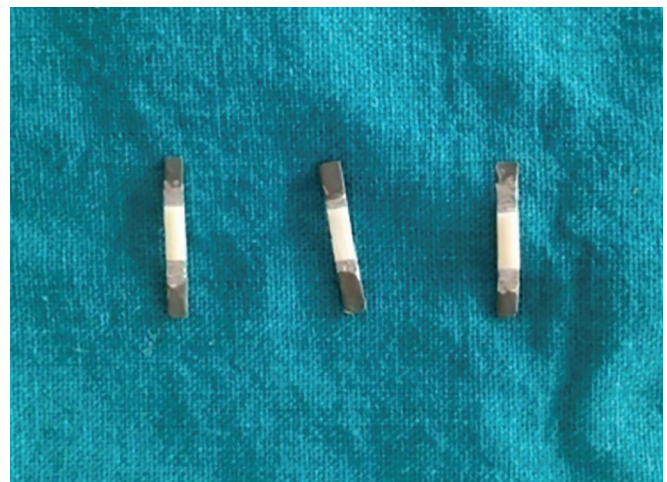
Fig. 1: Test samples

where \Sigma = bond strength (MPa), P = load (N), I = distance between the supports in mm, b = width of the sample in mm, d = thickness of the sample in mm.