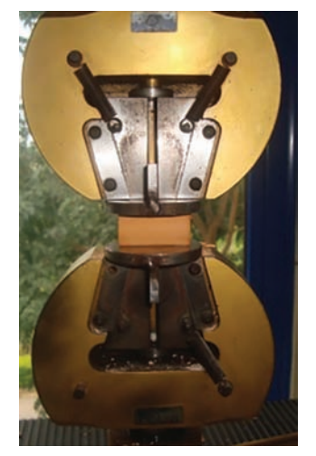
Fig. 1: Compressive load being applied

Gauging water for CaOCl<sub>2</sub>was prepared by adding 7.42 mL of CaOCl<sub>2</sub>solution (which contained 21 gm% of CaOCl<sub>2</sub>) into 292.6 mL of distilled water and made it to 300 mL, to make 0.5% concentration using the chemical formula C_1V_1 = C_2V_2 .