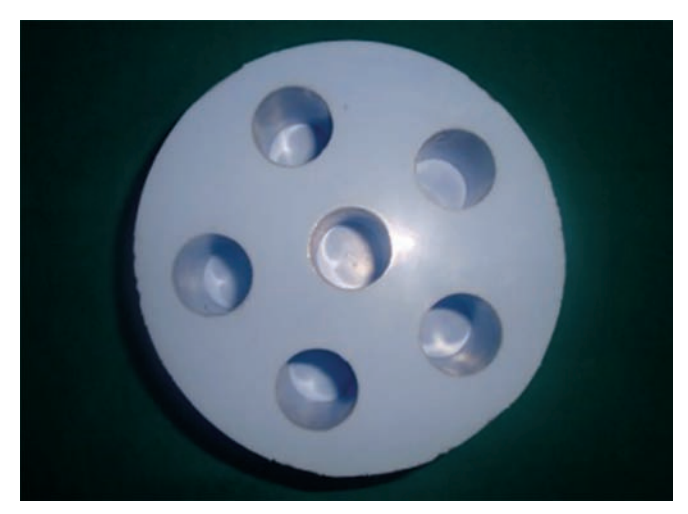
Fig. 2: Silicone mold

For fabrication of test specimens, both Kalrock and Pearlstone die stone powder were weighed on an electronic balance. The water:powder ratio was strictly followed according to manufacturer's instructions for all the groups. Distilled water was measured with the help