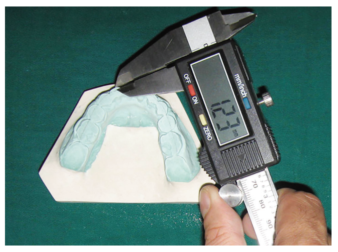
Fig. 6: Digital sliding calipers used to measure in–out or crown prominence

each tooth was measured from the embrasure line using digital sliding calipers (Fig. 6).