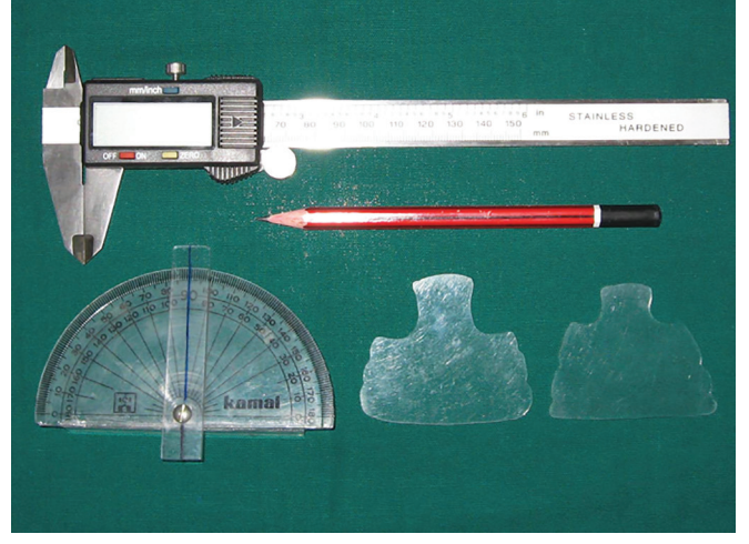
Fig. 1: Armamentarium used in the study

Measurements were recorded for the upper and lower central incisors, the lateral incisors, the canines, the second premolars, and the first molars as the sample consisted of cases which had their first premolars extracted during the treatment. Measurements recorded for the pretreatment models were designated as T_1 and those recorded for the posttreatment models were designated as T_2 .