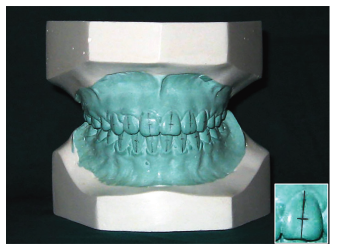
Fig. 2: The FACC (vertical line) and the FA point (junction of vertical and horizontal lines) marked on each crown