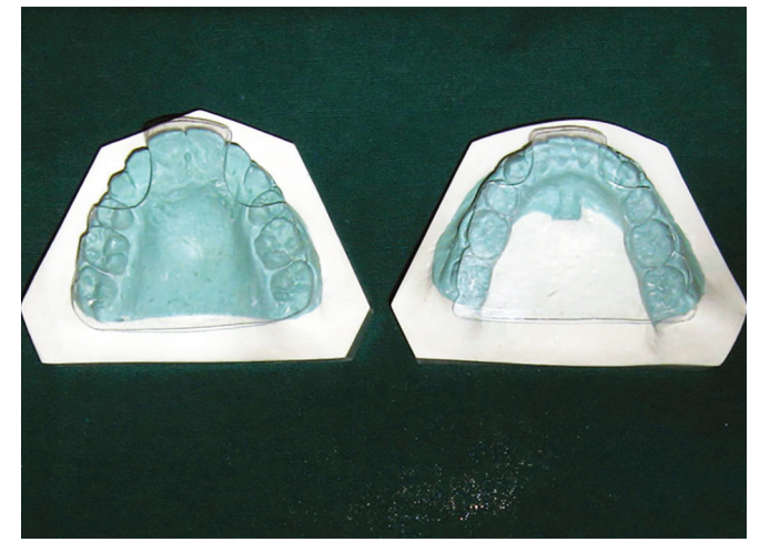
Fig. 3: Plastic occlusal templates set on the teeth