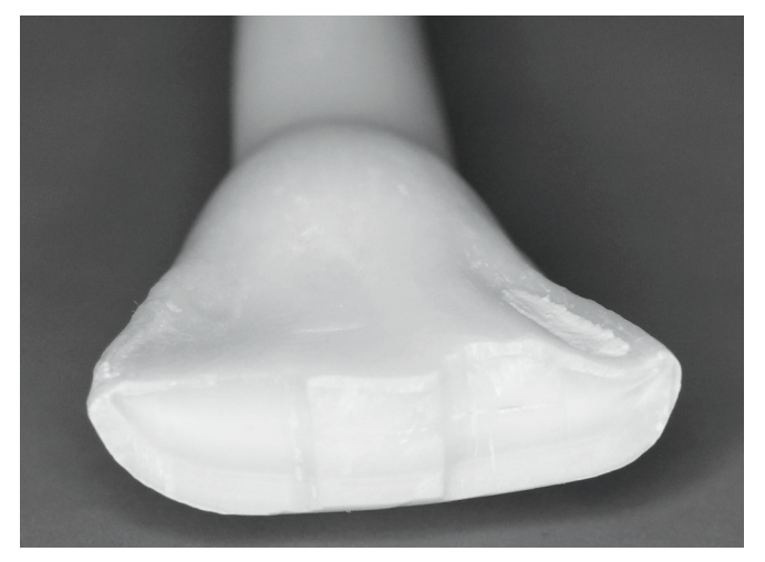
Fig. 1: Top view of incisal plateau

In group II (MP) (n = 15), a \frac{1}{4} metal bur (SS White, Rio de Janeiro, Brazil), associated with low speed